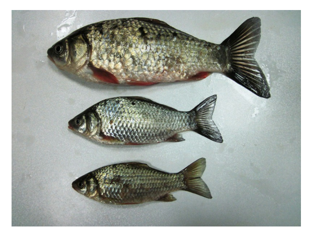
Figure 2. Carassius gibelio specimens caught in Tersakan Stream, Muğla, Turkey on 15 December 2011.

from scales removed from between the left lateral line and dorsal fin. Ageing was validated independently by a second operator interpreting true annuli (Bagenal and Tesch 1978).