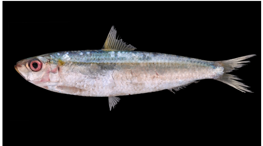
Figure 1. Sardinella gibbosa , TAU P.15090, 122.5 mm L_S , Ashdod, Israel Mediterranean, 26 Nov 2012 (Photo: O. Rittner).