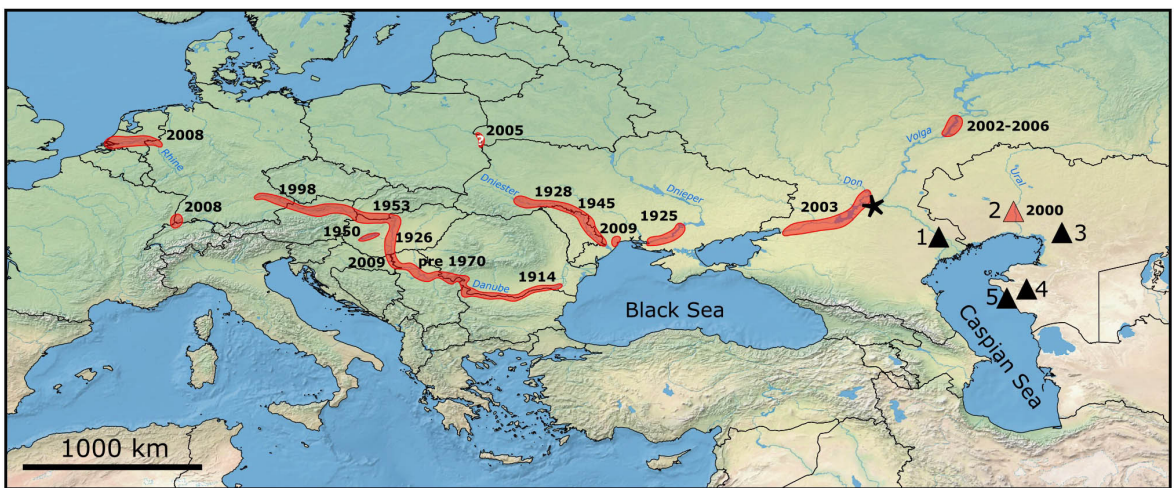
Figure 3. Geographic distribution of Dikerogammarus bispinosus and years of first reports. Localities from the current study are shown with triangles. Red triangle indicates the locality where D. bispinosus was collected. Question mark in SW Belarus is an unconfirmed/doubtful record and the black star indicates the position of the Volga-Don canal. See Table 2 for references.