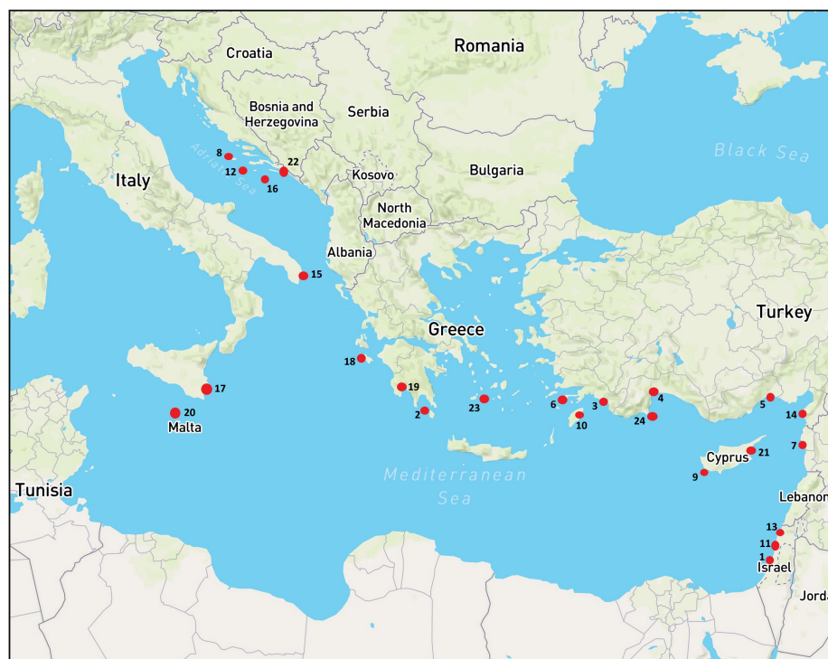
Figure 1. Eastern and central sectors of the Mediterranean Sea where Enchelycore anatina (Lowe, 1838) has been previously reported. The red dots show the known records in the Mediterranean depicting the spatio-temporal spread of the species: 1 – Tel Aviv (Israel), Ben-Tuvia and Golani 1984; 2 – Elafonissos Island (Greece), Golani et al. 2002; 3 – Fethiye Bay (Turkey), Altan 1998; 4 – Antalya Bay (Turkey), Yokes et al. 2002; 5 – Mersin coast (Turkey), Can and Bilecenoglu 2005; 6 – Datca Peninsula (Turkey), Okuş et al. 2004; 7 – Coast of Syria (Syria), Saad 2005; 8 – Island of Bisevo, Vis (Croatia), Lipej et al. 2011; 9 – Coast of Cyprus (Cyprus), Katsanevakis et al. 2009; 10 – Kolimbia Bay, Rhodes Island (Greece), Kalogirou 2010; 11 – Hertliyya north of Tel-Aviv (Israel), Lipej et al. 2011; 12 – Island of Susac (Croatia), Lipej et al. 2011; 13 – Northern Haifa Bay (Israel), Lipej et al. 2011; 14 – Iskenderun Bay (Turkey), Ergüden et al. 2013; 15 – Apulian coast (Italy), Guidetti et al. 2012; 16 – Bijelac Islet near Lastovo Island (Croatia), Dulčić et al. 2014; 17 – Plemmirio marine reserve (Italy), Katsanevakis et al. 2014; 18 – National Marine Park of Zakynthos (Greece), Kapiris et al. 2014; 19 – Kalamaki beach (Greece), Pirkenseer 2013; 20 – Island of Malta (Malta), Deidun et al. 2015; 21 – Agio Anargyroi (Cyprus), Iglésias and Frotté 2015; 22 – Lopud Island (Croatia), Bartulović et al. 2017; 23 – Kyklades Archipelago (Greece), Dailianis et al. 2016; 24 – Phaselis (Turkey), Teker et al. 2019 (for details see Supplementary material Table S1).

Katsanevakis et al. 2014), Maltese waters (Deidun et al. 2015) and Adriatic coasts (Lipej et al. 2011; Dulčić et al. 2014; Bartulović et al. 2017). These reports show that this species probably established reproductive populations in the Mediterranean waters (Kalogirou 2010). This dispersal success over a broad geographical range could putatively be attributed to the fangtooth moray's long pelagic larval stage (Golani et al. 2006). E. anatina is a demersal inshore species usually inhabiting rocky bottoms at depths of 3–60 m (Kalogirou 2010), but it has even been reported in shallower waters (Dailianis et al. 2016). It is a nocturnal predator mainly feeding on benthic fish, cephalopods and crustaceans, reaching 120 cm in total length (Göthel 1992; Kalogirou 2010). The main characteristics of this fish are a very elongated body with large yellowish blotches arranged in longitudinal rows, a dorsal fin which is very long and originating above branchial opening, and an anal fin which is confluent with the caudal fin. The head is