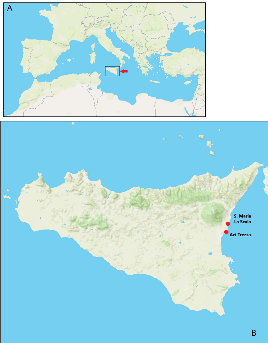
Figure 2. A) Geographical location of the study area (arrow) in the eastern coast of Sicily, Ionian Sea; B) Detail of the areas (red dots) of Santa Maria La Scala and Aci Trezza, where the E. anatina specimens were recorded.

pointed with an elevated occipital region. The anterior nostril is tubular, while the posterior one can be round- to oval-shaped and opens in front of eyes. The mouth is large and the jaws are arched with fang-like teeth visible even when the mouth is closed (Golani et al. 2002).