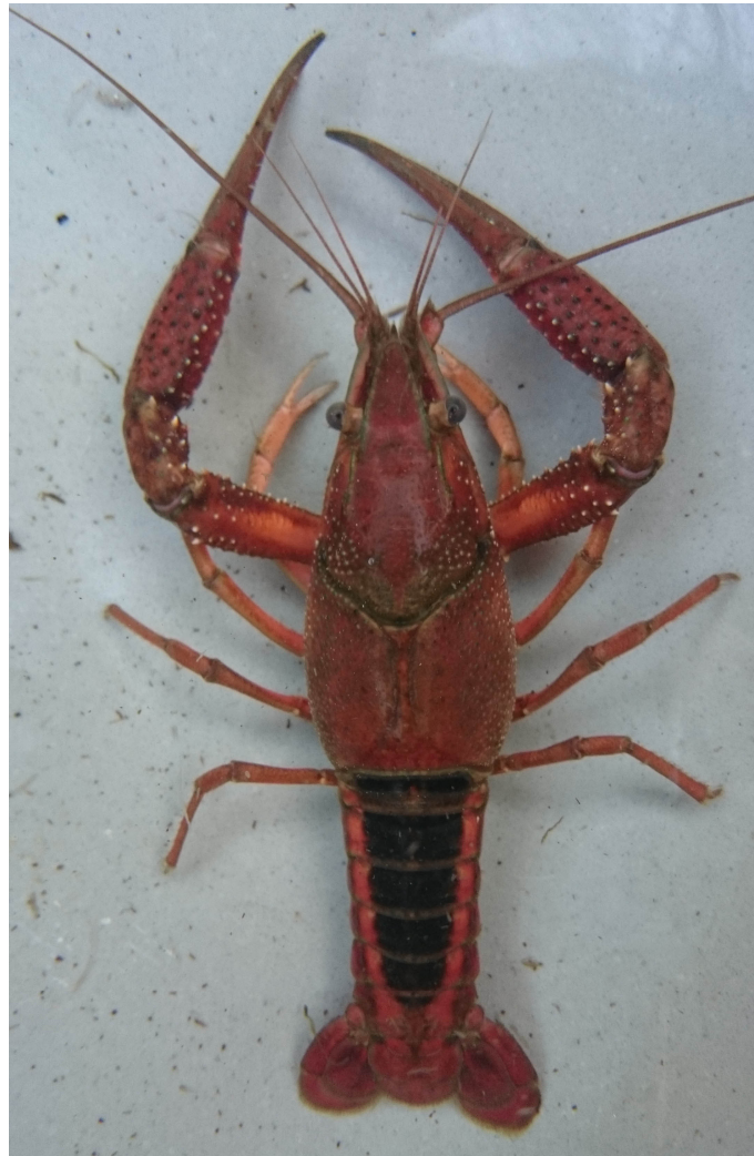
Figure 1. Male specimen of Procambarus acutus acutus (Girard, 1852) collected at the site near Verrebroek.