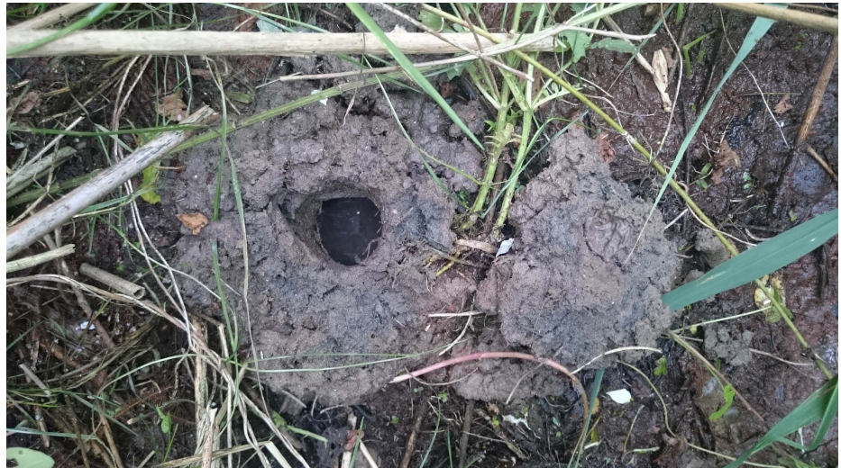
Figure 3. Underground burrow (with top of chimney removed for inside view) at the site near Verrebroek. In this burrow, one subadult female of Procambarus cf. acutus acutus was collected.