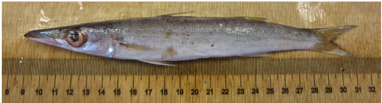
Figure 1. One of the four specimens of Sphyraena chrysotaenia caught in North Crete.