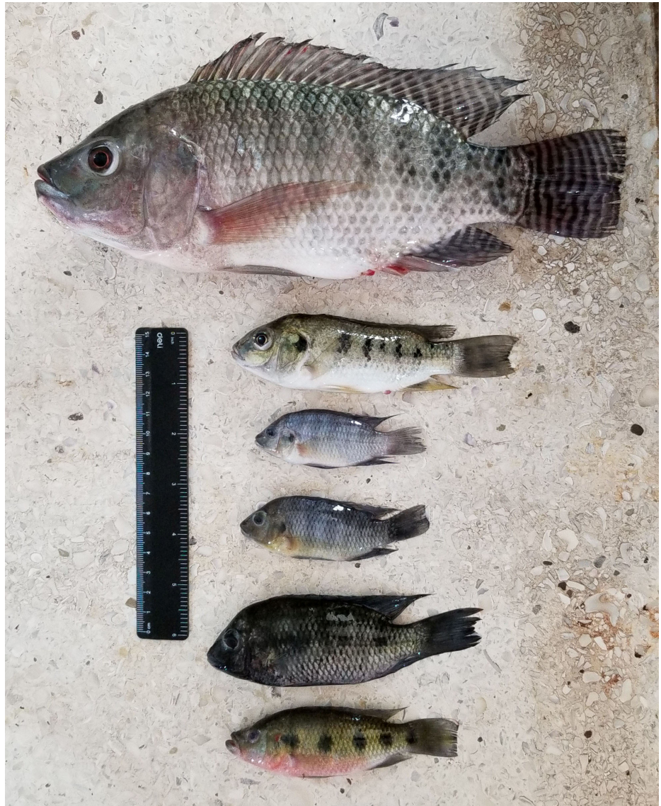
Figure 2. Size comparison of the alien and native cichlid species of Lake Bosomtwe captured in the first sampling. From top to bottom: Oreochromis niloticus , Chromidotilapia güntheri , Sarotherodon galileaus , Tilapia busumana , Coptodon discolor , Hemichromis fasciatus .

Oreochromis , Tilapia , and Sarotherodon spp., that are indigenous to Africa and the southwestern Middle East (Canonica et al. 2005). Tilapiine species are tolerant to sub-optimal water quality, which allows them to survive for extended periods of time under conditions that would be detrimental to other species. Certain tilapia species, such as O. niloticus , are well-suited to aquaculture production because of their potential for fast-growth and tolerance of a wide range of environmental fluctuations. Oreochromis niloticus , in particular, can acclimate readily to changes in salinity levels, can survive chronic hypoxic conditions, can feed at different trophic levels, and tolerate high stocking densities (McKaye et al. 1995; Coward and Little 2001). The wide environmental tolerances and trophic adaptability of this species coupled with its high reproductive rate, however, predispose it for successful establishment as an invasive species in natural waters into which they escape (Trewavas 1983; Costa-Pierce 2003).