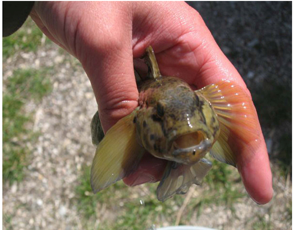
Figure 5. Round goby ( Neogobius melanostomus ).