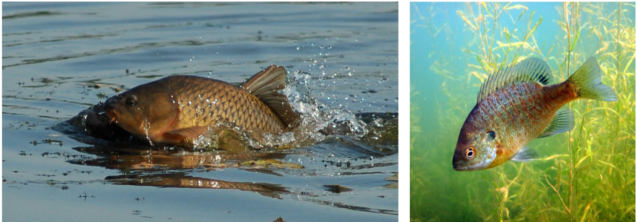
Figure 1. Left: common carp ( Cyprinus carpio ) spawning in a shallow vegetated area of Lake Keller, Minnesota, USA, Photo credit: Carrie Magnuson, Ramsey Washington Metro watershed District. Right: bluegill ( Lepomis macrochirus ), an abundant predator on common carp eggs and larvae in Minnesota, USA. Photo credit: Gretchen Hansen.

increase turbidity, and increase transport of nutrients from the sediments into the water column (Zambrano et al. 2001; Bajer et al. 2009; Vilizzi et al. 2015). If excessively abundant (> 100 kg/ha), carp can “flip” shallow lakes from a clear water state with submerged aquatic vegetation into turbid systems that lack aquatic vegetation and are dominated by algae (Bajer et al. 2009). This leads to reduced numbers of waterfowl (Haas et al. 2007), amphibians (often through predation on tadpoles), insects, and possibly also fish (Jackson et al. 2010; Kloskowski 2011).