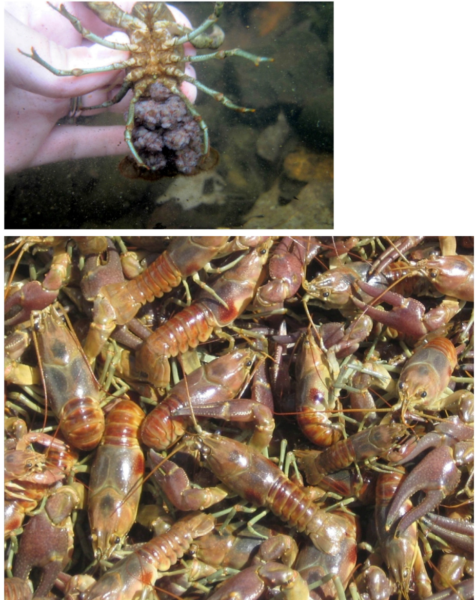
Figure 3. Rusty crayfish ( Orconectes rusticus ). Top: female with juveniles attached. Bottom: rusty crayfish obtained from trapping.

aquatic macrophytes used by other species as a refuge from predation and/or a food source (Magnuson et al. 1975; Crowder and Cooper 1982; Olsen et al. 1991; Lodge et al. 1994; Rosenthal et al. 2006). As a result of their destruction of aquatic plants combined with direct interactions, invasive rusty crayfish reduce the densities of bluegill and pumpkinseed ( Lepomis gibbosus ) (hereafter Lepomis ) sunfish (Wilson et al. 2004; Roth et al. 2007) and invertebrate populations, particularly snails, (Olsen et al. 1991; Lodge et al. 1994). However, the effects of rusty crayfish on non-snail macroinvertebrates are highly variable across lakes (Wilson et al. 2004; McCarthy et al. 2006; Hansen et al. 2013a), in part due to high variability in the abundance of invasive rusty crayfish (Vander Zanden and Olden 2008; Hansen et al. 2013c).