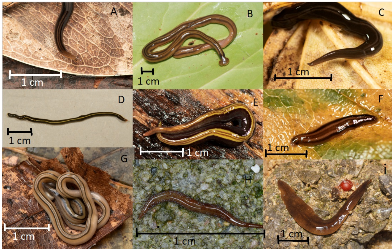
Figure 1. Photographs of the alien terrestrial planarian species found indoors and outdoors in The Netherlands: Anisorhynchodemus sp., found in greenhouses in Rotterdam, Amsterdam and Arnhem (A, Photo by Roy Kleukers); Bipalium kewense found in greenhouses Amsterdam, Utrecht and Leiden (B, Photo by Pierre Gros); Parakontikia ventrolineata found in a garden in Amsterdam Noord (C, Photo by Roy Kleukers); Caenoplana coerulea found in a greenhouse in Nijmegen (D, Photo by Roy Kleukers); Caenoplana variegata found in gardens in Castricum, Bleiswijk, Hillegersberg, Zwijndrecht, Zaandam and Heemstede (E, Photo by Roy Kleukers); Caenoplana cf. micholitzi found in a greenhouse in Arnhem (F, Photo by Roy Kleukers); Dolichoplana sp. found in greenhouses in Amsterdam and Arnhem, (G, Photo by Roy Kleukers); Marionfyfea adventor found in gardens in Goes, Schiedam and Beek-Ubbergen (H, Photo by Jochem Kuhnen) and Obama cf. nungara found in a garden center in Gilzen (I, Photo by Pierre Gros).

in five other gardens (De Waart 2016; De Waart et al. 2021). In 2019, C. variegata appeared to be established in a garden, and is thus able to survive the Dutch winters (De Waart et al. 2021). The blue spotted land planarian Marionfyfea adventor was recorded in gardens in 2012 and 2020 (Jones and Sluys 2016). One individual of Obama nungara was observed in a garden centre in 2020 (De Waart et al. 2021). Parakontikia ventrolineata was observed in a garden in Amsterdam Noord in 2020 (De Waart et al. 2021). The species Anisorhynchodemus sp., Caenoplana micholitzi and Dolichoplana sp. have only been observed in heated greenhouses in 2020 (De Waart et al. 2021).