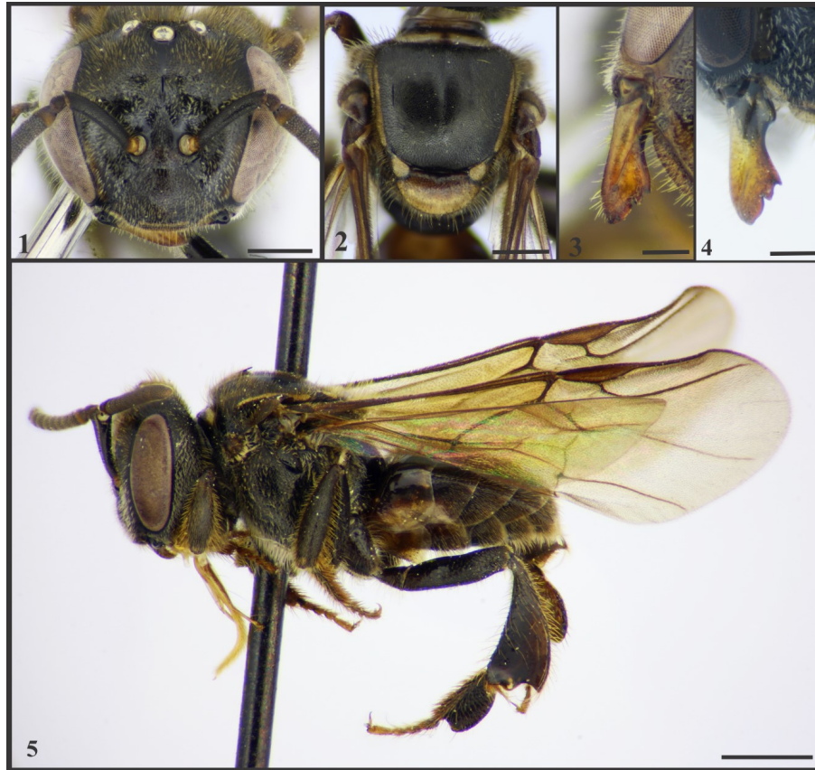
Figs. 1-5. Worker of Plebeia mansita sp. nov. 1, head in frontal view; 2, mesosoma in dorsal view; 3, detail of mandible; 4, detail of mandible of Plebeia saiqui ; 5, lateral view. Scale bars 1 and 2 = 0.5 mm; 3 and 4 = 0.25 mm; 5 = 1 mm.