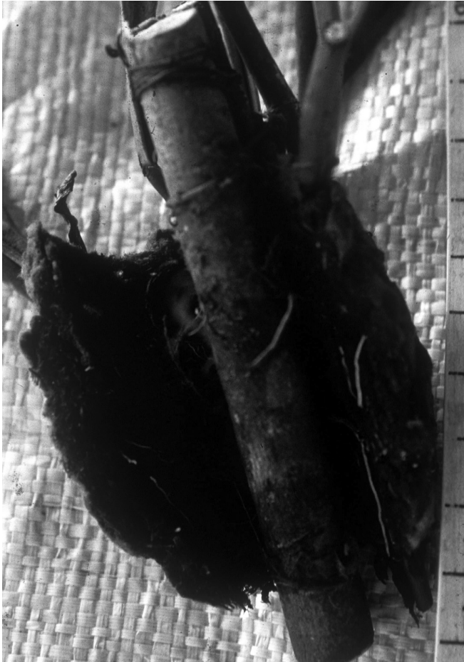
Figure 1. Polytaenium cajenense, dorsiventral rhizome with pseudodomatia or "external" domatia.