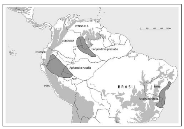
Figure 1. Map of the distribution of the three piassaba species in South America.

The genus Aphandra includes only one species, Aphandra