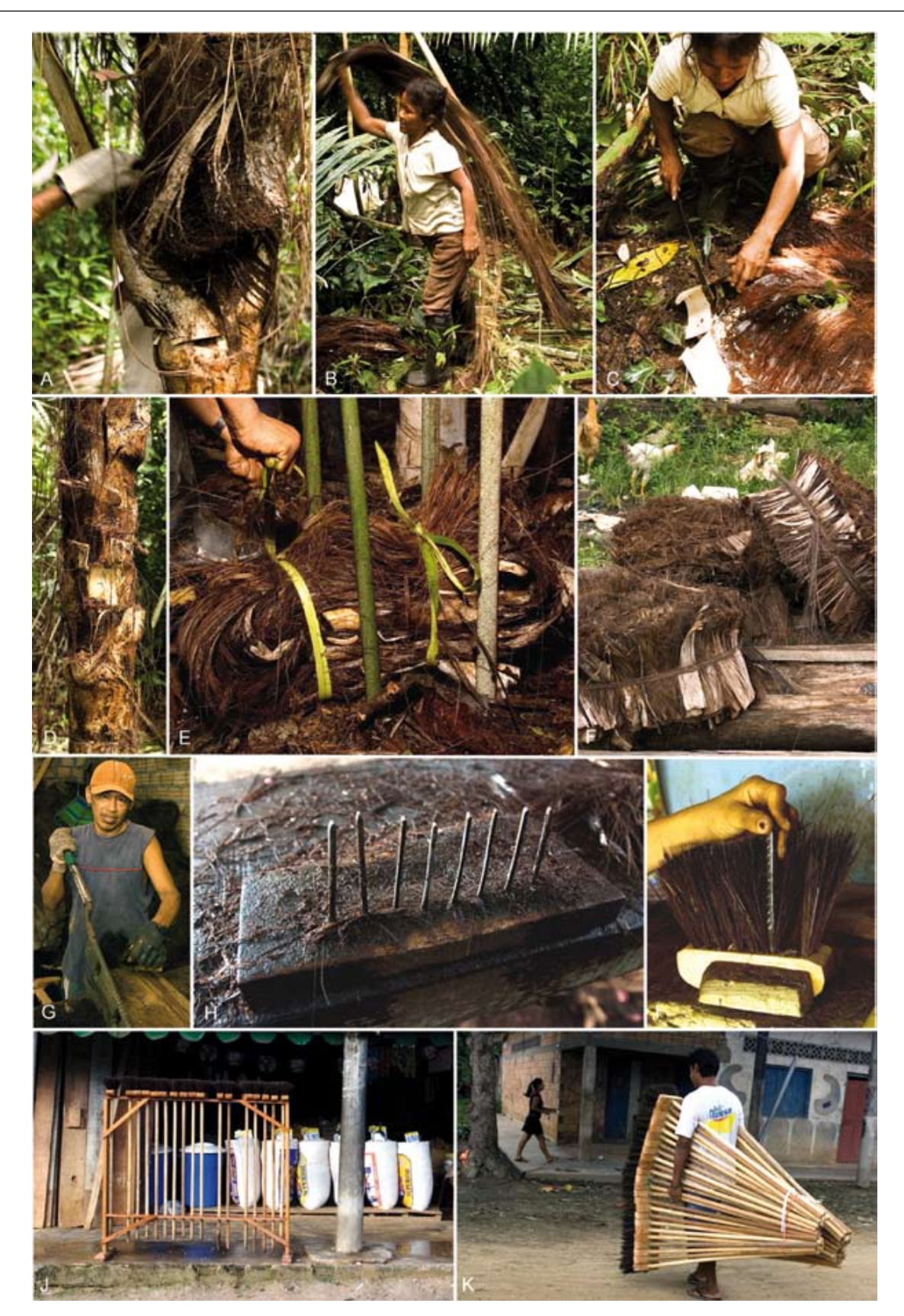
Figure 5. Harvest and manufacturing of brooms from Aphandra natalia fibers, (chronological sequence). A. Three cuts are made in order to separate the fibers from the palm. B. Cleaning of fibers is carried out by shaking them back and forth. C. Sheath residues are cut of the basal part of the fibers. D. A stem subsequent to harvest. E. Bundles of fiber are tied with liana into bigger bundles of fibers. F. Bundles of fibers. G. Fibers are cut into a suitable length. H. The comb used for cleaning the fibers. I. Fibers are inserted into the brooms heads. J. Piassaba