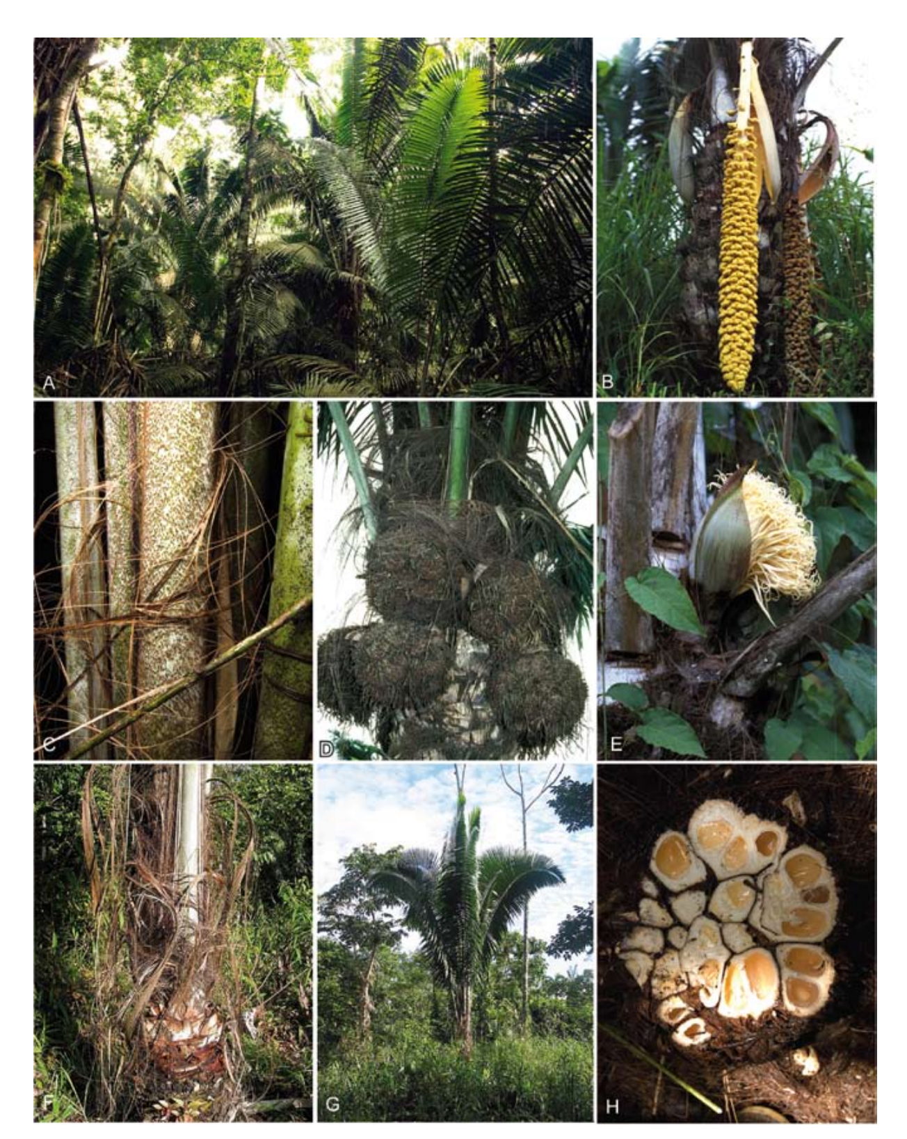
Figure 3. A. Stand of Aphandra natalia. B. Male inflorescence. C. Base of petiole with numerous brown scales. D. Infructescences. E. Female inflorescence. F. Leaf sheath with fibers. G. Single tree after harvest. H. Infructescence cut in half making the immature jelly-like endosperm visible. A, C, H: Rio Corrientes, Peru (2007). B, D, E: Sucua, Ecuador (1985). G, H: Rio Pastaza, Ecuador (2004).