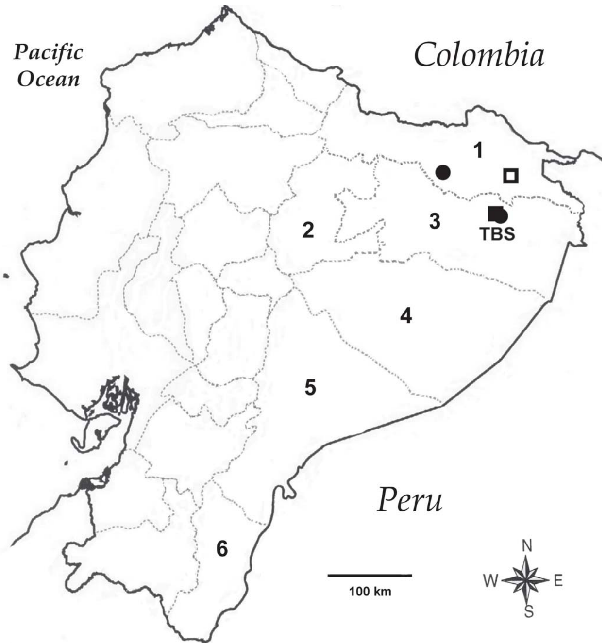
Figure 1. Known records of Batrachemys heliostemma (squares) and Batrachemys raniceps (circles) in the Republic of Ecuador. TBS = Tiputini Biodiversity Station, closed symbols = material studied, open symbols = literature records (see text), numbers correspond to the following provinces in Amazonian Ecuador: 1 = Sucumbíos, 2 = Napo, 3 = Orellana, 4 = Pastaza, 5 = Morona-Santiago, 6 = Zamora-Chinchipec.