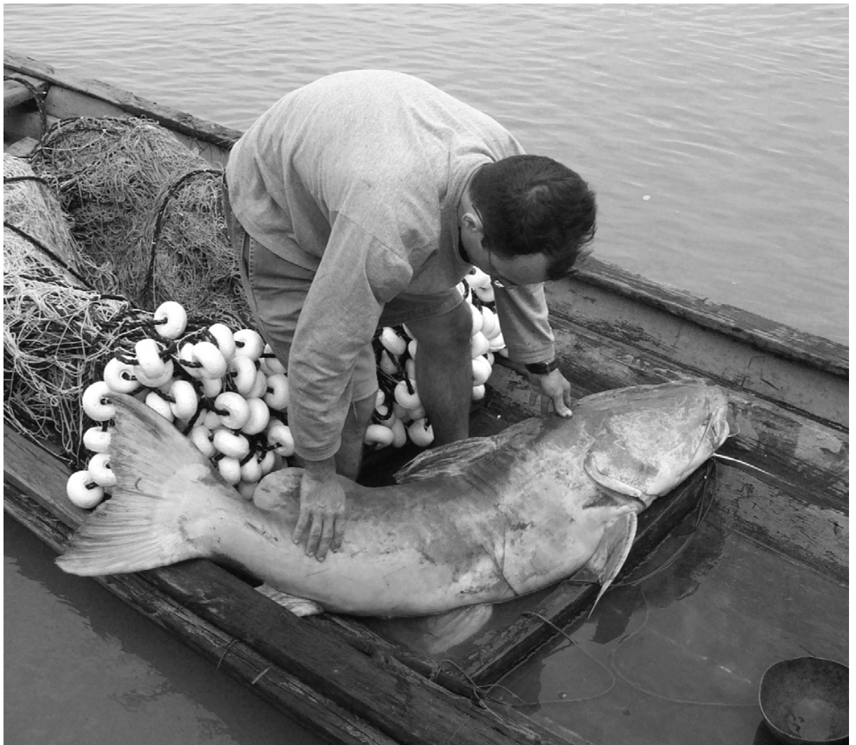
Fig. 1. A giant jau catfish ( Zungaro zungaro ) still on the canoe, being examined for candirus. Note a candiru attached on the middle of the caudal fin.