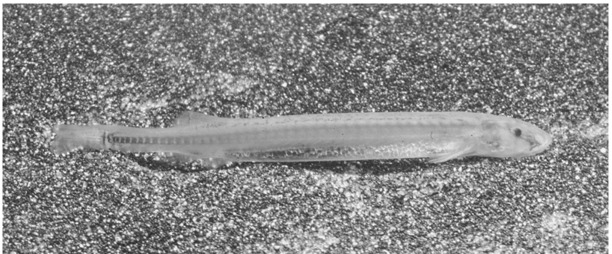
Fig. 4. Lateral view of the candiru Paracanthopoma sp. in field aquarium. Note the long and sloping snout, stout body, partly digested blood in the distal part of the gut, and fat globules along the abdominal wall.