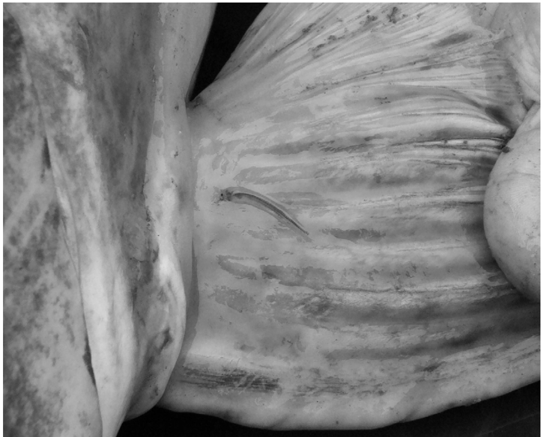
Fig. 2. A candiru ( Paracanthopoma sp.) with its snout buried into the pectoral fin of the giant catfish Zungaro zungaro . Note that the candiru 's eyes are exposed.