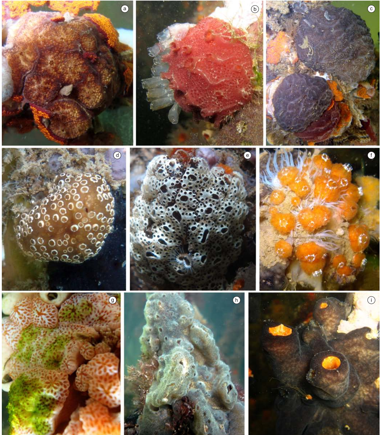
Figure 3. a, b, c) Polyclinum constellatum Savigny, 1816; d, e) Distaplia bermudensis Van Name, 1902; f, g) Distaplia stylifera (Kowalevsky, 1874); h) Diplosoma listerianum (Milne-Edwards, 1841); i) Didemnum cineraceum (Sluiter, 1898).