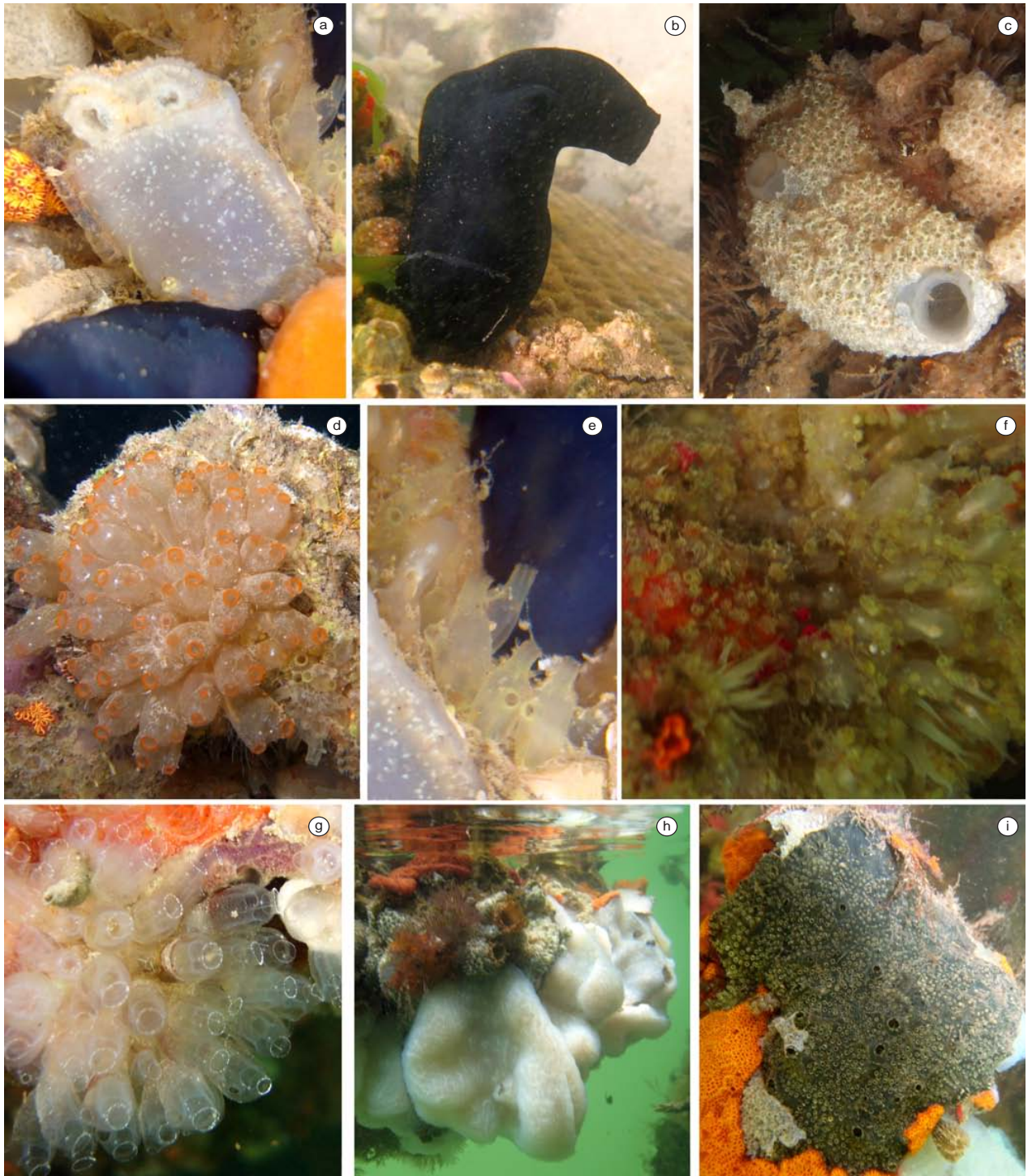
Figure 2. a) Rhodosoma turcicum (Savigny, 1816); b) Phallusia nigra Savigny, 1816; c) Ascidia curvata (Traustedt, 1882) covered by Symplegma brakenhielmi ; d) Ecteinascidia turbinata Herdman, 1880; e) Ecteinascidia styeloides (Traustedt, 1882); f) Perophora viridis Verrill, 1871; g) Clavelina oblonga Herdman, 1880; h) Aplidium accarense (Millar, 1953); i) Polyclinum constellatum Savigny, 1816.