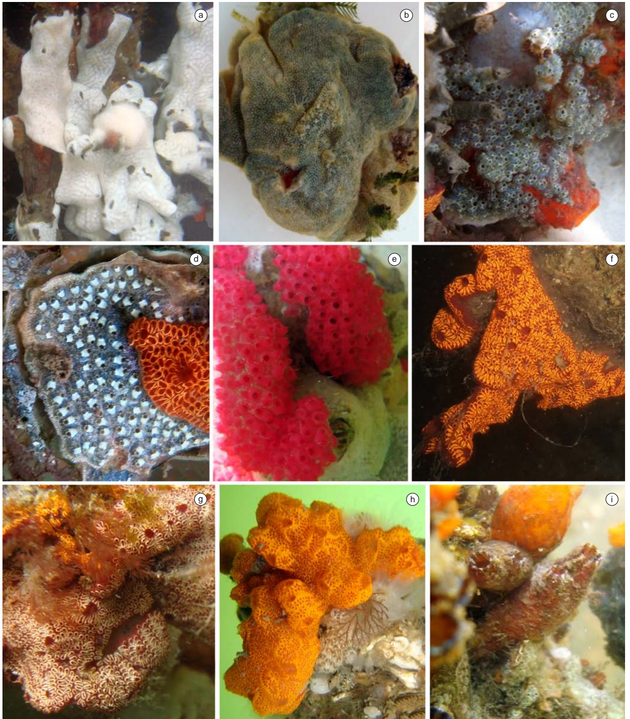
Figure 4. a) Didemnum perlucidum Monniot, 1983; b) Trididemnum orbiculatum (Van Name, 1902); c,d) Symplegma brakenhielmi (Michaelsen, 1904); e) Symplegma rubra Monniot, 1972; f, g) Botrylloides nigrum (Herdman, 1886); h) Botrylloides sp.; i) Styela canopus Savigny, 1816.