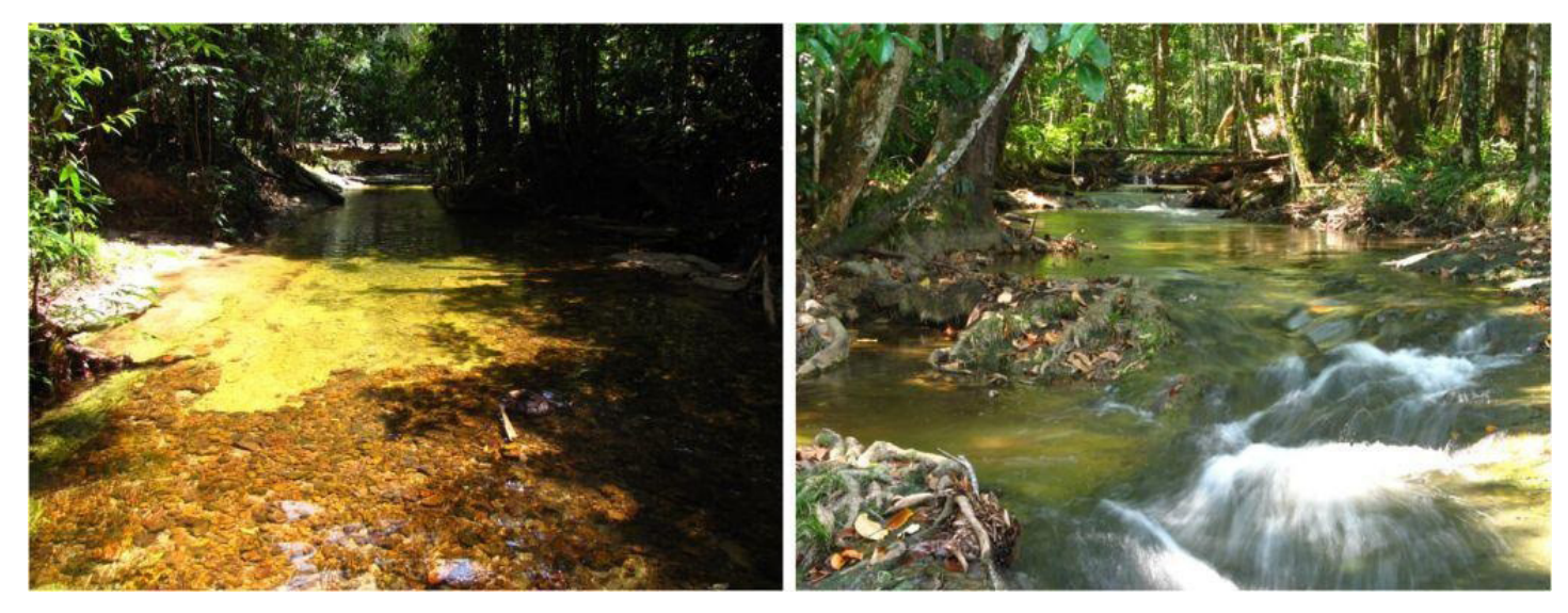
Figure 2: Marupiara´rocky stream, Presidente Figueiredo – Amazonas, Brazil. The samples were collected along stretch between less turbulent waters with dominance of released stones (left) and more turbulent waters with slabs of rock (right).

Of the 43 individuals whose stomachs were examined, 13 had empty stomachs (three Characidium aff. declivirostre and 10 Leptocharacidium omospilus ). We have registered 21 food items that were grouped into 12 taxonomic categories: larvae and pupae of Diptera (Chironomidade, Simulidae, Empidae, Tipulidae and Ceratopogonidae), larvae of Trichoptera (Hydropyschydae, Odontoceridae and Hydroptilidae), larvae and adults of Coleoptera (Elmidae), larvae of Lepidoptera (Pyralidae), nymphs of Ephemeroptera (Baetidae, Leptohyphydae, Leptophlebiidae and Caenidae), larvae of Megaloptera, nymphs of Odonata (Colopterygidae) and nymphs of Plecoptera (Perlidae), arachnids (aquatic mites), algae, organic debris (amorphous organic matter) and plant material (Table 1).