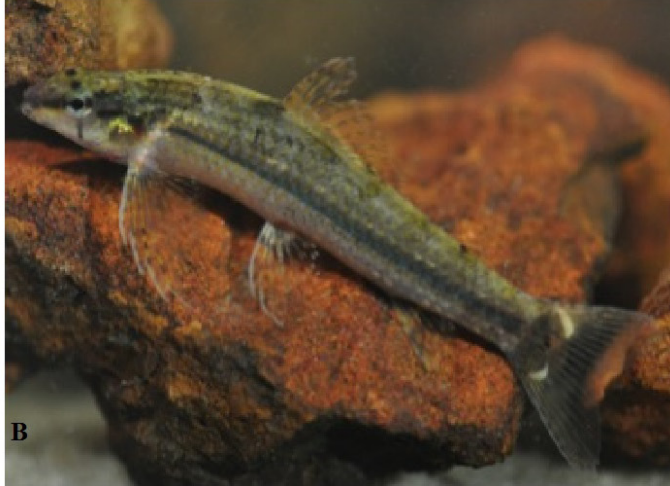
Figure 1: Characidium aff. declivirostre (A) and Leptocharacidium omospilus (B) specimens caught in Marupiara'rocky stream, Presidente Figueiredo – Amazonas, Brazil.