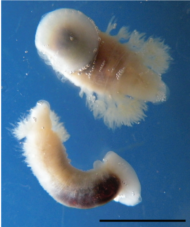
Figure 2. Two specimens of Ozobranchus margoii that were found attached to the loggerhead turtle. Bar 1 cm.

of juveniles and eggs, predatory fishing and water pollution contribute towards this risk. In order to avoid decreases in turtle populations, conservation programs are currently in progress in Brazil (MARCOVALDI; MARCOVALDI, 1999). It is important to note that, as a further important conservation procedure, the diseases that affect sea turtles should be identified. Occurrences of parasitic and infectious diseases can impair animal health and also cause death, thus reducing sea turtle numbers. In this regard, Ozobranchus spp. represents a health hazard to sea turtles, since it can cause direct damage and also be a vector for infectious agents.