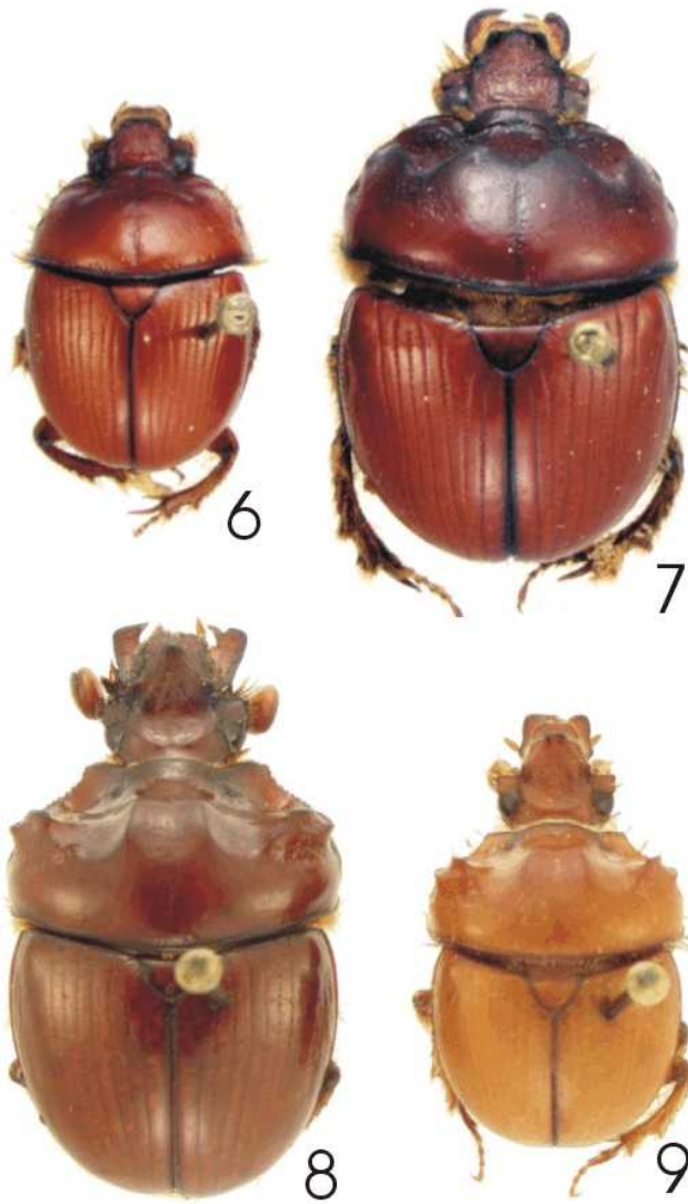
FIGURES 6 - 9. 6) Bolborhombus sallaei (Bates), dorsal view; specimen from Apodaca, Nuevo León. 7) B. magnus Howden, dorsal view, specimen from Apodaca, Nuevo León. 8) Bolbocerastes imperialis Cartwright, dorsal view, male from Matehuala, San Luis Potosi. 9) B. imperialis Cartwright, dorsal view, male from Phoenix, Arizona. Figures 6 and 7 to same scale; Figures 8 and 9 to same scale.