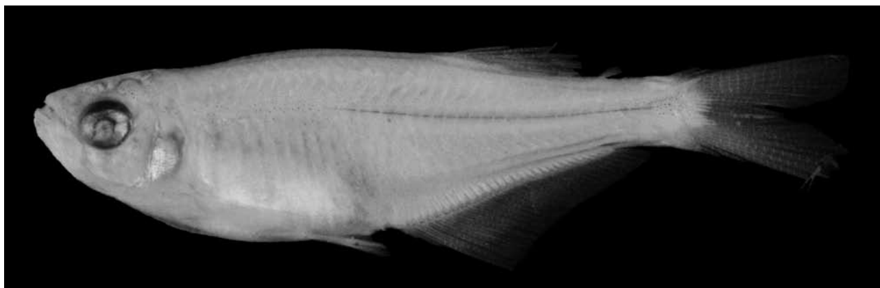
Figure 1. Gephyrocharax valencia , male, UWIZM 2010.14.253, 25.34 mm SL, Moriquite River, southern coast of Trinidad.