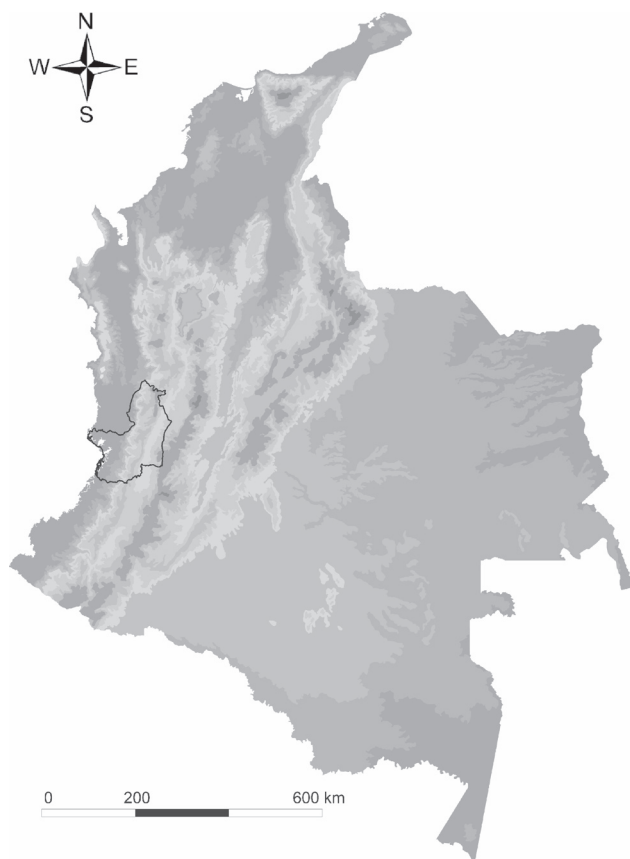
Figure 1. Location of the study area.

The natural limits of the department are the Pacific Ocean on West and the Cauca River on the South. It is bordered by the departments of Caldas and Risaralda in the North, Chocó in the North-West, Quindío and Tolima in the North-East and Cauca in the South (Bolívar et al., 2004).