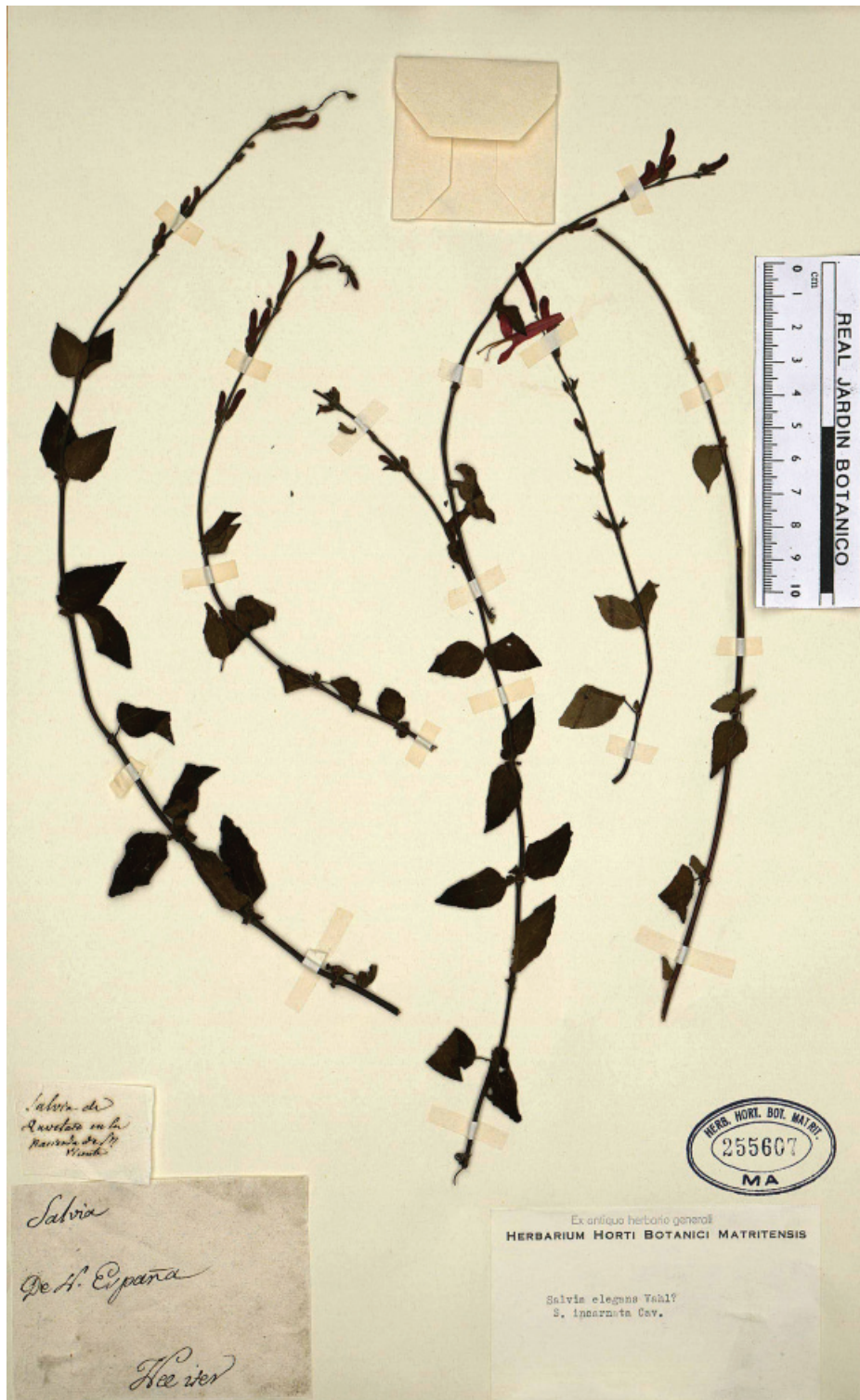
Figure 1. One of 2 specimens at MA bearing number 255607, with annotation by Née but not by Cavanilles.