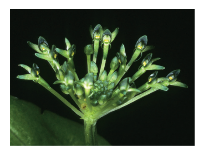
Figure 1. Inflorescence of Malaxis rzedowskiana (from a plant from Guerrero, Mexico: Salazar et al. 6437 , MEXU).