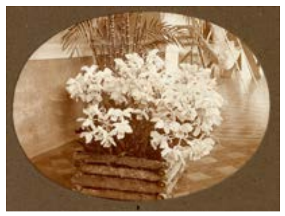
FIGURE 6. Orchids in Lankester's house in Cachí, photographed by himself.

Pleurothallis dentipetala Rolfe and Pleurothallis costaricensis Rolfe.