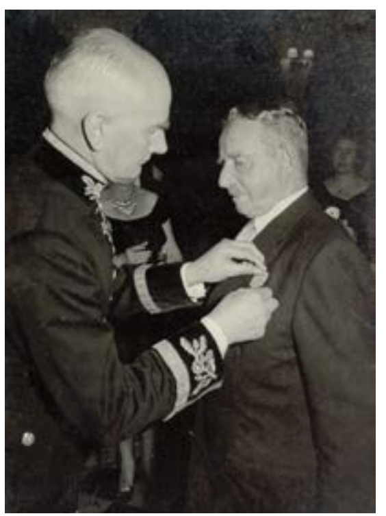
Figure 17. Lankester receiving the Order of the British Empire from the British Embassador, San José, 1961.

The Lankester Botanical Garden. "Cóncavas" (= concavities) is the local Spanish name for circular, clay-filled depressions, several hundred feet in diameter and three to four feet-deep. They are frequently found to the east of the Costa Rican city of Cartago. These depressions often fill with water and form large lagoons, a paradise for the migratory birds, which fly to Costa Rica during the last months of the year to escape the harshness of the North American winter.