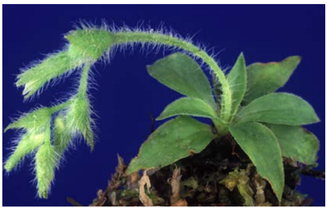
FIGURE 10. Lankesterella costaricensis Ames, the type species of the genus that Ames dedicated to his favorite collector. Photograph by F. Pupulin.

387 is not an orchid, it is a Bromeliad" wrote Ames in 1923. Lankester replied: "Look again". An unusual new orchid genus had been discovered. Ames admitted his error and a week later wrote to Lankester: "There seems to be a new genus among your specimens, Lankesterella would be a good name" (Fig. 10).