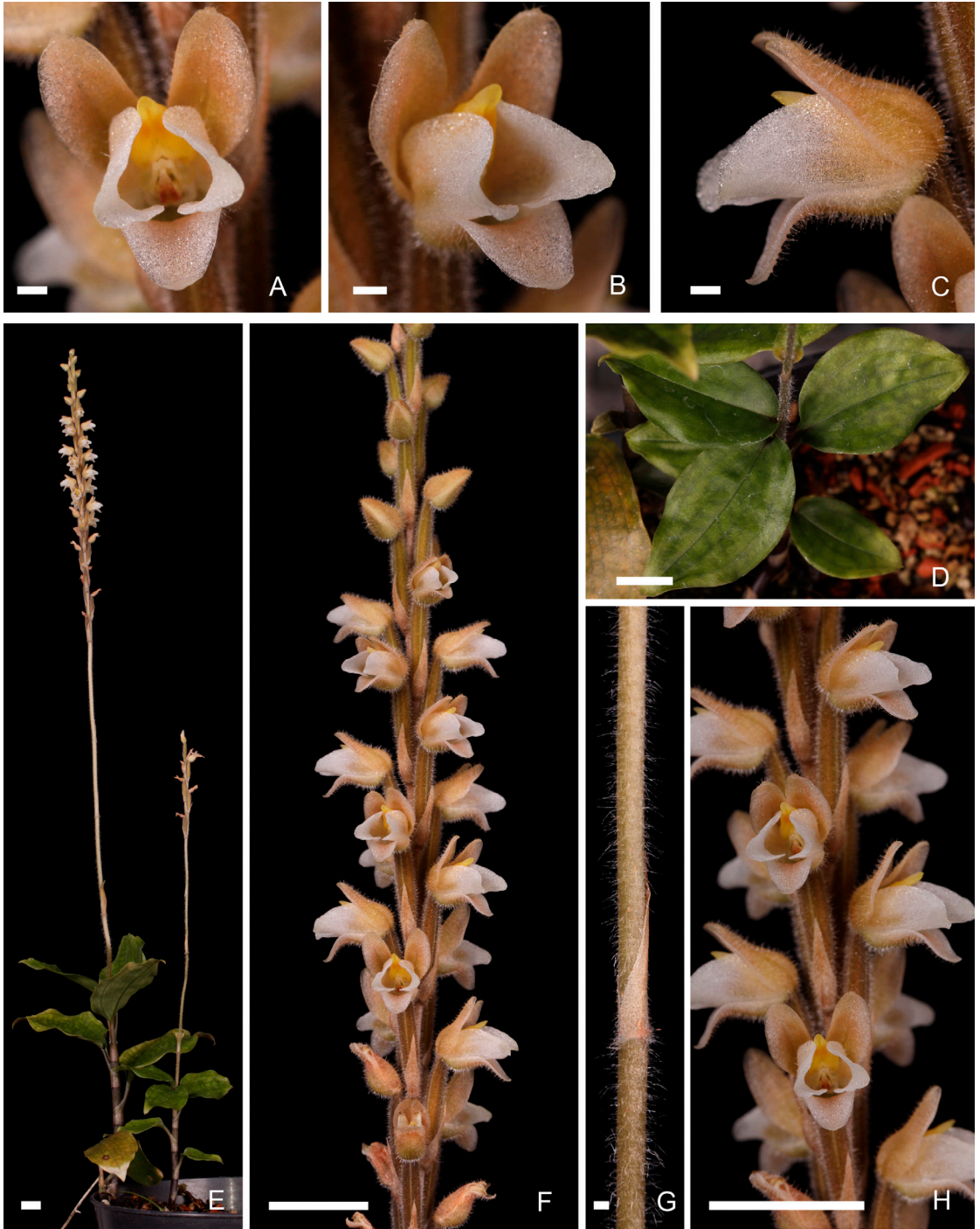
FIGURE 1. Hetaeria finlaysoniana . A. Flower from the front. B. Flower. C. Flower from the side. D. Leaves. E. Habit. F. Inflorescence. G. Peduncle with sterile bract. H. Closeup of the inflorescence. Scale bars: A, B, C, G = 1 mm; D, E, F, H = 1 cm. Cultivated in Prague Botanical Garden (Leg. J. Ponert 523, PRC!).