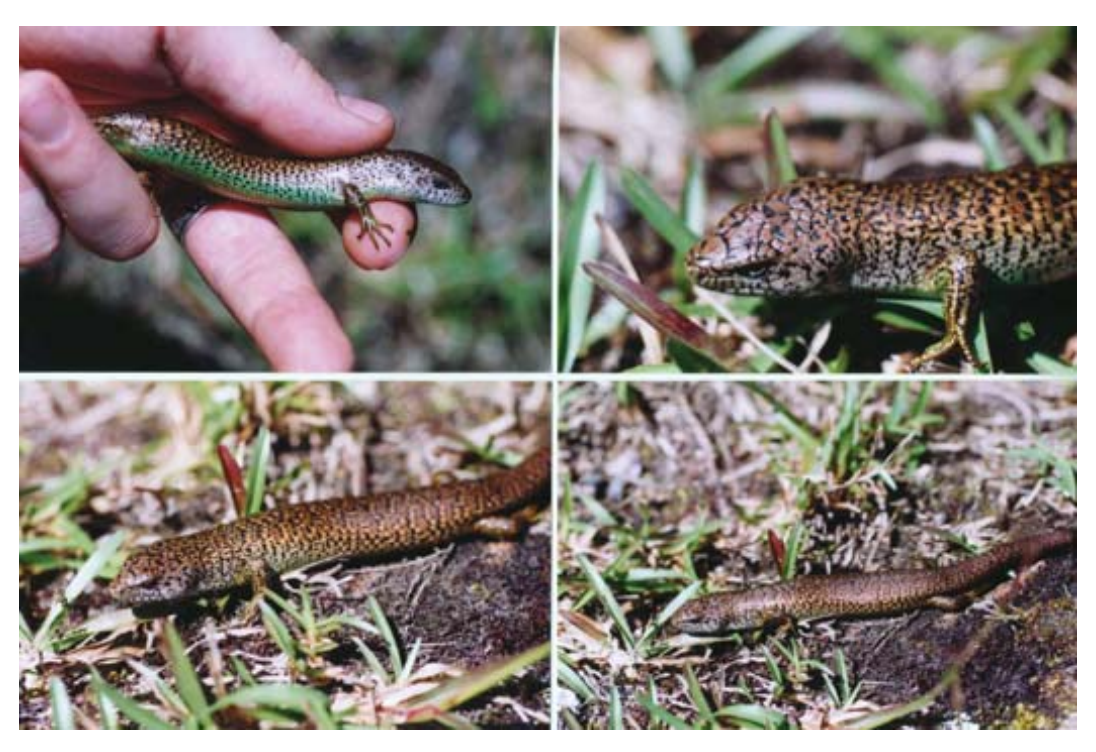
Fig. 3. Celestus orobius from Costa Rica: Provincia de San José: Parque Nacional de Chirripó Grande, 1 800 m.