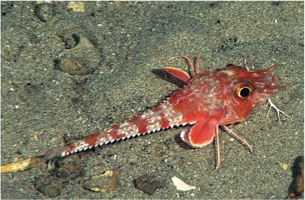
Fig. 1. Photograph of Peristedion nesium , n. sp. taken from a submersible at Isla del Coco, Costa Rica by Avi Klapper. Depth not recorded.