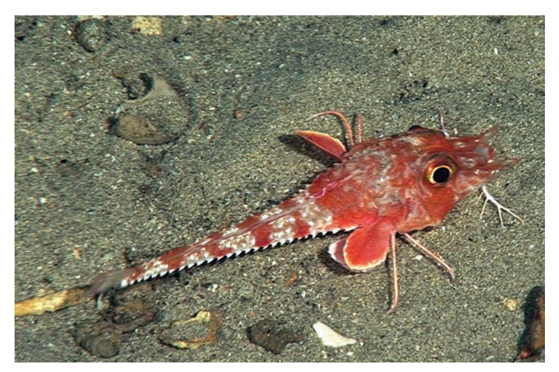
Fig. 1. Photograph of Peristedion nesium , n. sp. taken from a submersible at Isla del Coco, Costa Rica. Depth not recorded.