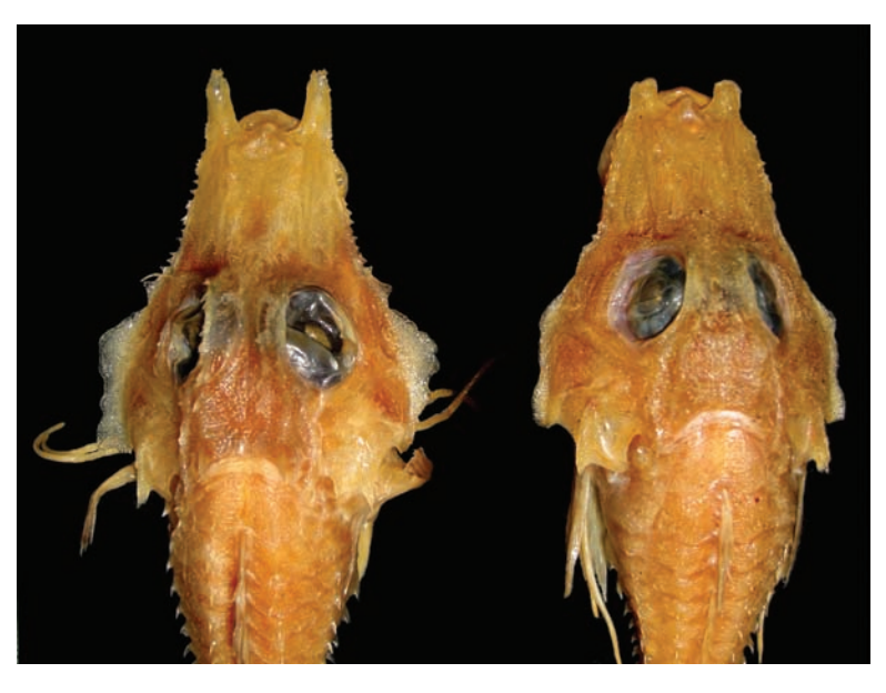
Fig. 3. Dorsal view of heads of Peristedion crustosum , LACM 20838, from Islas Galápagos (left side); holotype of Peristedion nesium , n. sp. from Isla del Coco (right side).