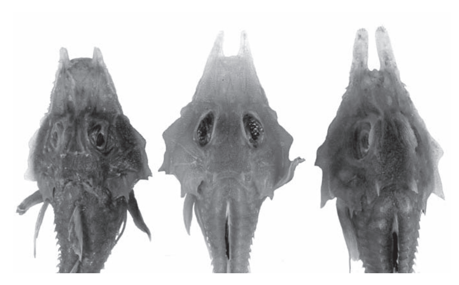
Fig. 4. Dorsal view of head of three species of Eastern Pacific Peristedion from Costa Rica. left, P. nesium , n. sp. UCR 720.007, 105.6mm; middle, P. crustosum , UCR 501.001, 108.4mm; right, P. barbiger , UCR 489.001, 107.5mm.