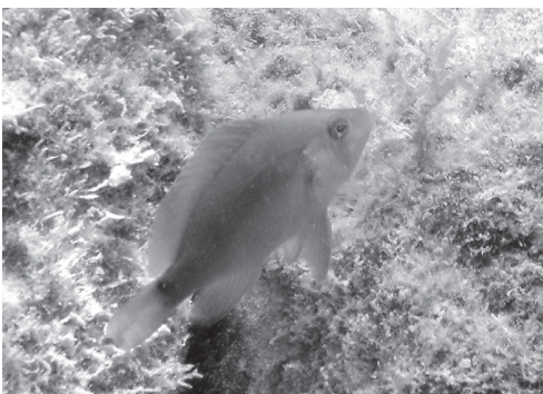
Fig. 2. Tan Hamlet, Hypoplectrus sp., in Lamershure Bay, St. John, U.S. Virgin Islands (2001).