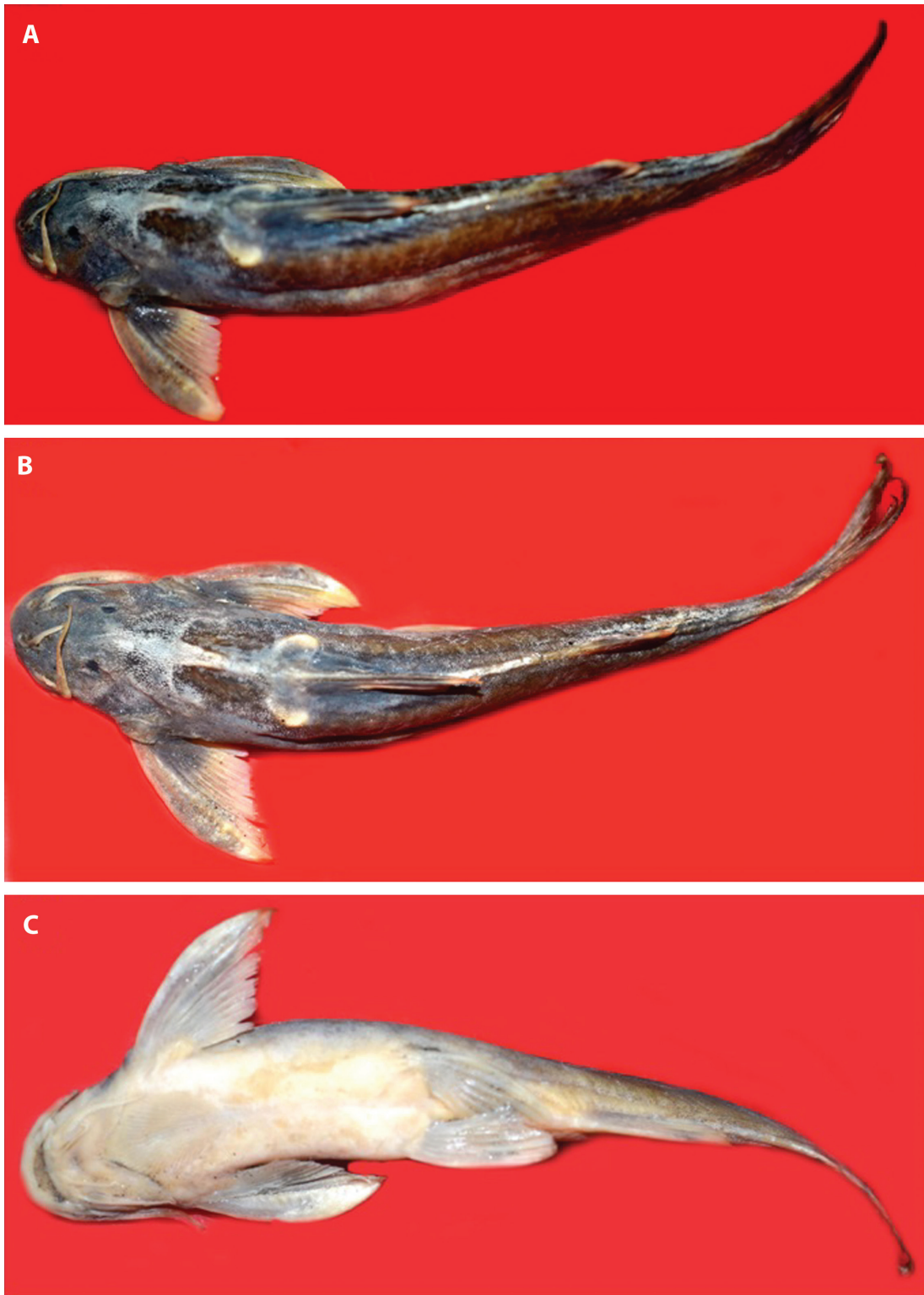
Fig. 1. Glyptothorax conirostris (a) lateral view (b) dorsal view (c) ventral view.