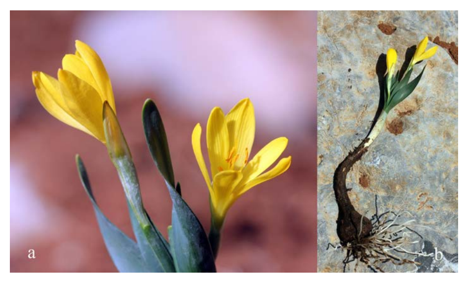
Fig. 4. Sternbergia vernalis: a, b, near the village of Beduhê on the Berwarya Mountain, photo by S. Youssef, 21 Feb 2014.

The Kurdistan Region of Iraq is a rich territory in terms of floristic diversity as a part of the Irano-Anatolian hotspot and hosts a number of rare, threatened, and endemic species. We have characterised their habitat, vegetation community structure, and population size, and estimated the environmental threats. Due to their rarity status, with many of their natural habitats under threat, S. colchiciflora, S. clusiana, and S. vernalis should be regarded as potentially endangered species at a regional level, but without precision about the threat level because of lacking information —DDreg, i.e., "Data Deficient regionally"—, according to the IUCN criteria (IUCN Species Survival Commission, 2001, 2003; IUCN Standards and Petitions Working Group, 2006). However, the small population of S. fischeriana occurring near the Beduhé Dam after its recent construction, suggests that it was probably more abundant before the dam and its natural habitat has been impacted by it. Since the Iraqi flora is one of the less documented in the Middle East region,