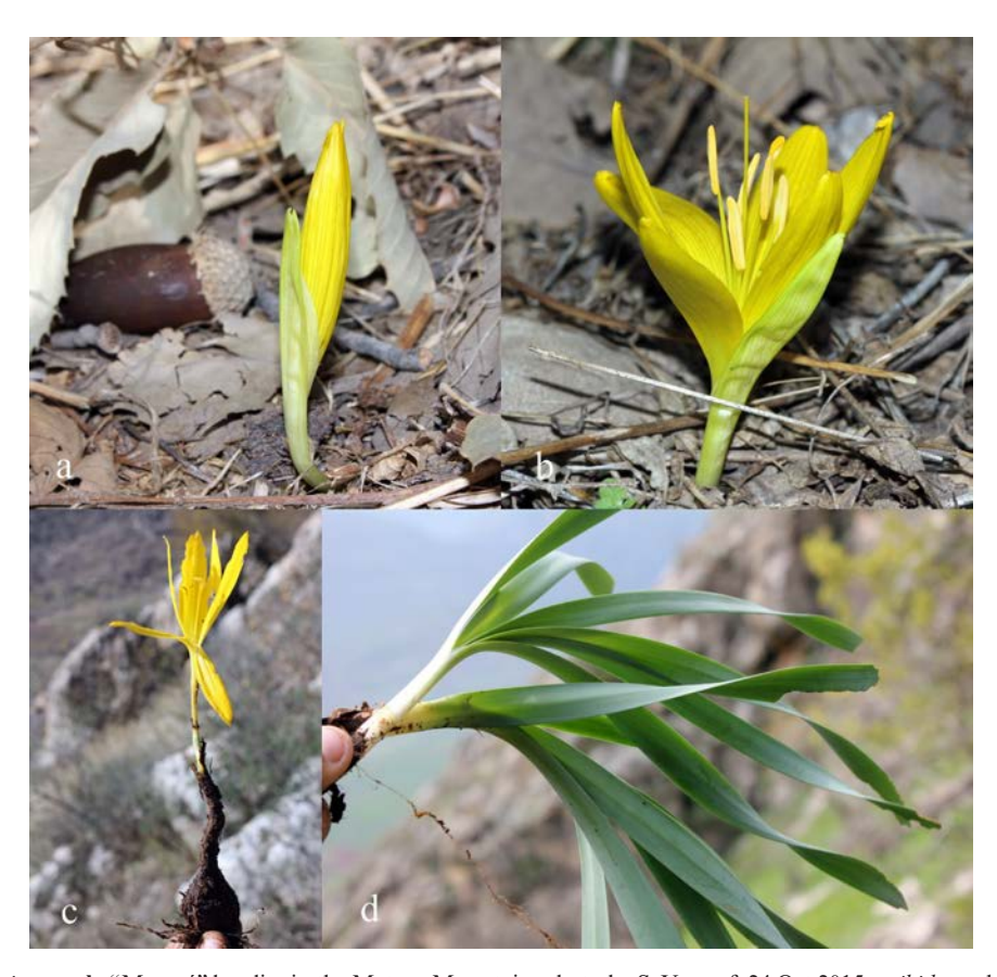
Fig. 3. Sternbergia clusiana: a, b, "Mergué" locality in the Mateen Mountain, photo by S. Youssef, 24 Oct 2015; c, ibidem, photo by S. Youssef, 4 Dec 2014; d, ibidem, photo by S. Youssef, 4 Apr 2015.

Observations.—It is a common and widespread species in the eastern Mediterranean and the Irano-Anatolian mountains (Mathew, 1983, 1984), occurring in southern Turkey, Syria, Lebanon, Israel, Jordan, and throughout Iraq to Iran. Sternbergia clusiana has been considered as a lost species in the Iraqi territory for more than 60 years. It has been rediscovered in this study on a rocky steep slope at Mergué hamlet in the eastern Mateen Mountain —37° 3' 56" N, 43° 43' 54" E (Fig. 1). This population was not registered in Flora of Iraq (Wendelbo, 1985).