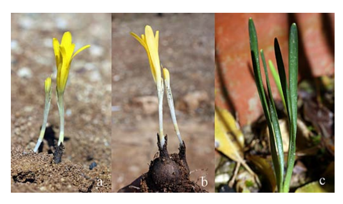
Fig. 2. Sternbergia colchiciflora: a, b, "Banka" locality in the western Mateen Mountain, photo by S. Youssef, 15 Oct 2015; c, cultivation, photo by E. Véla, 5 Feb 2017.

Observations.—At a global scale, S. colchiciflora occurs over a very wide area in southern Europe, the Mediterranean region, and