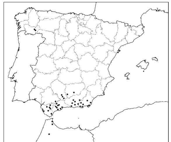
Fig. 4. Distribution of Orobanche gracilis var. deludens .

Orobanche gracilis var. deludens is distributed in the western Mediterranean Region (Fig. 4). It grows in three discontinuous regions: NW Iberian Peninsula, with just a few populations; S Spain, where it seems to be relatively abundant; and NW Africa, in the Rif and High Atlas mountains of Morocco, where it seems to be undercollected. It grows in rocky areas, often on dry grasslands or degraded scrubland. It parasites perennial Fabaceae, namely species of Ulex ( U. parviflorus