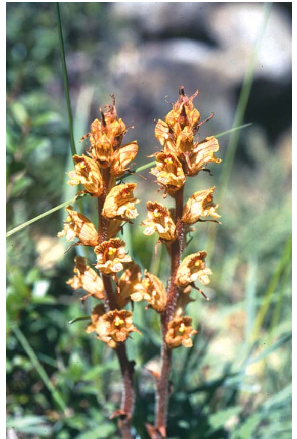
Fig. 2. Orobanchaceae var. deludens , Grazalema, Cádiz (COA 33916) showing yellowish-brown internal corollas.