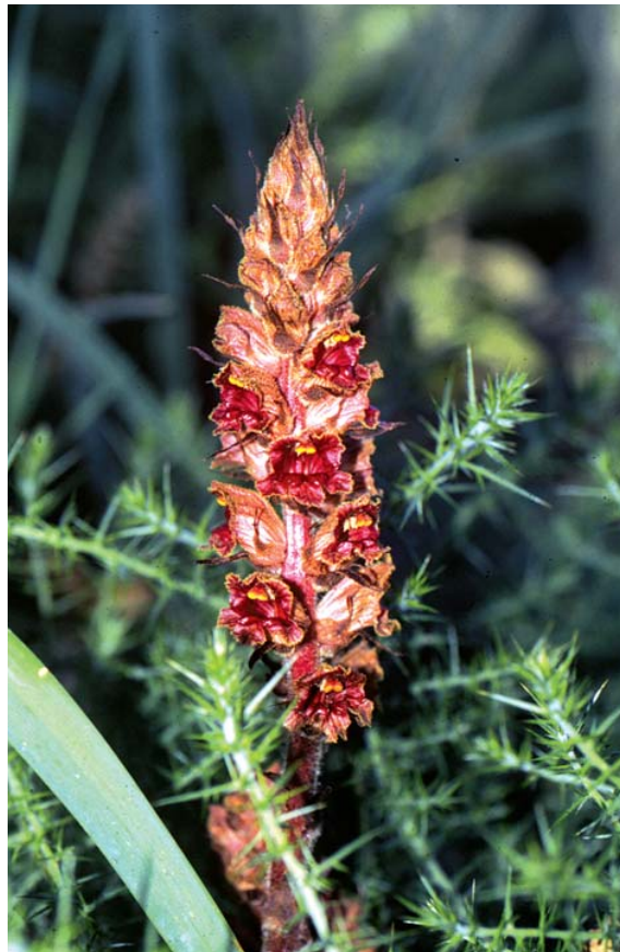
Fig. 3. Orobanche gracilis var. deludens , Grazalema, Cádiz (COA 33917) showing reddish internal corollas.

Illustrations: Figs. 1-3; Foley (2001b: 65, Lám. 20, as Orobanche austrohispanica ); Pujadas Salvà (2002: 432, Foto 168, as Orobanche gracilis var. spruneri ).