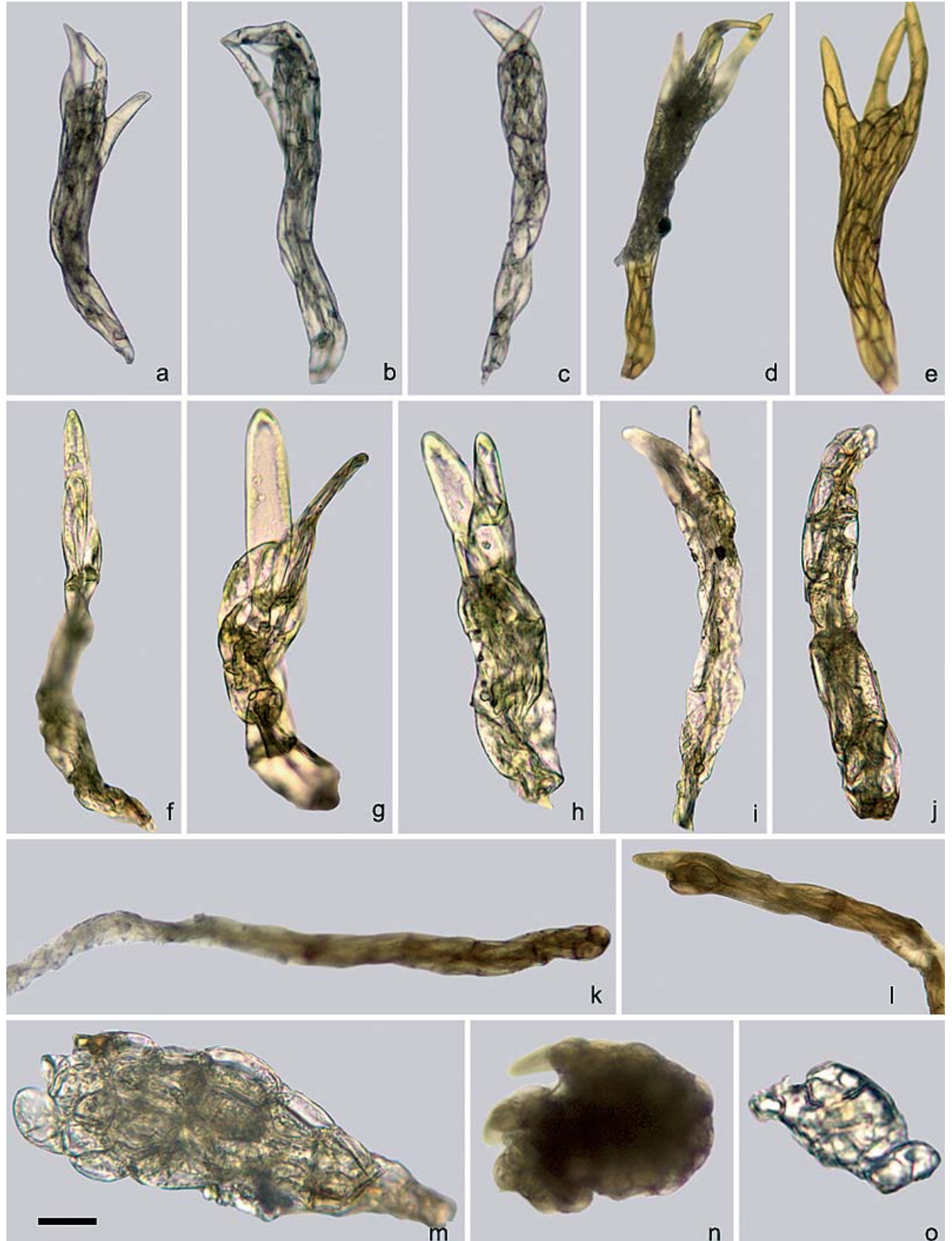
Fig. 2. Pohlia annotina (MA 7549): a-e , bulbils. P. prolifera (MUB 1584): f-i , bulbils. P. flexuosa (MUB 21471): j-l , vermicular bulbils; m, n , sinuous outline bulbils; o , bulbils angular outline with papillae. Scale: a-e = 35 \mu m; f-i = 35 \mu m; j = 25 \mu m; k, l, n, o = 30 \mu m; j = 20 \mu m; m = 12 \mu m.