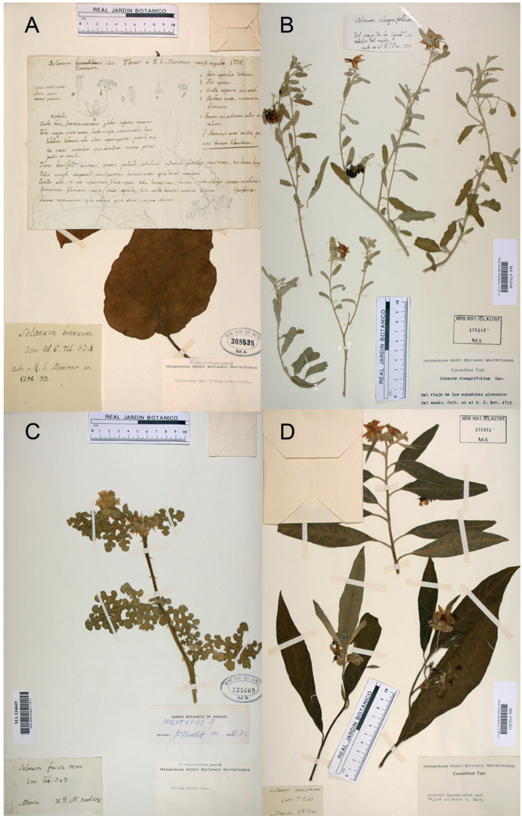
Fig. 1. A , lectotype of Solanum betaceum Cav. (MA 308535); B , lectotype of Solanum elaeagnifolium Cav. (MA 476348-2); C , lectotype of Solanum fructo-tecto Cav. (MA 334669); D , lectotype of Solanum lanceolatum Cav. (MA 476351).