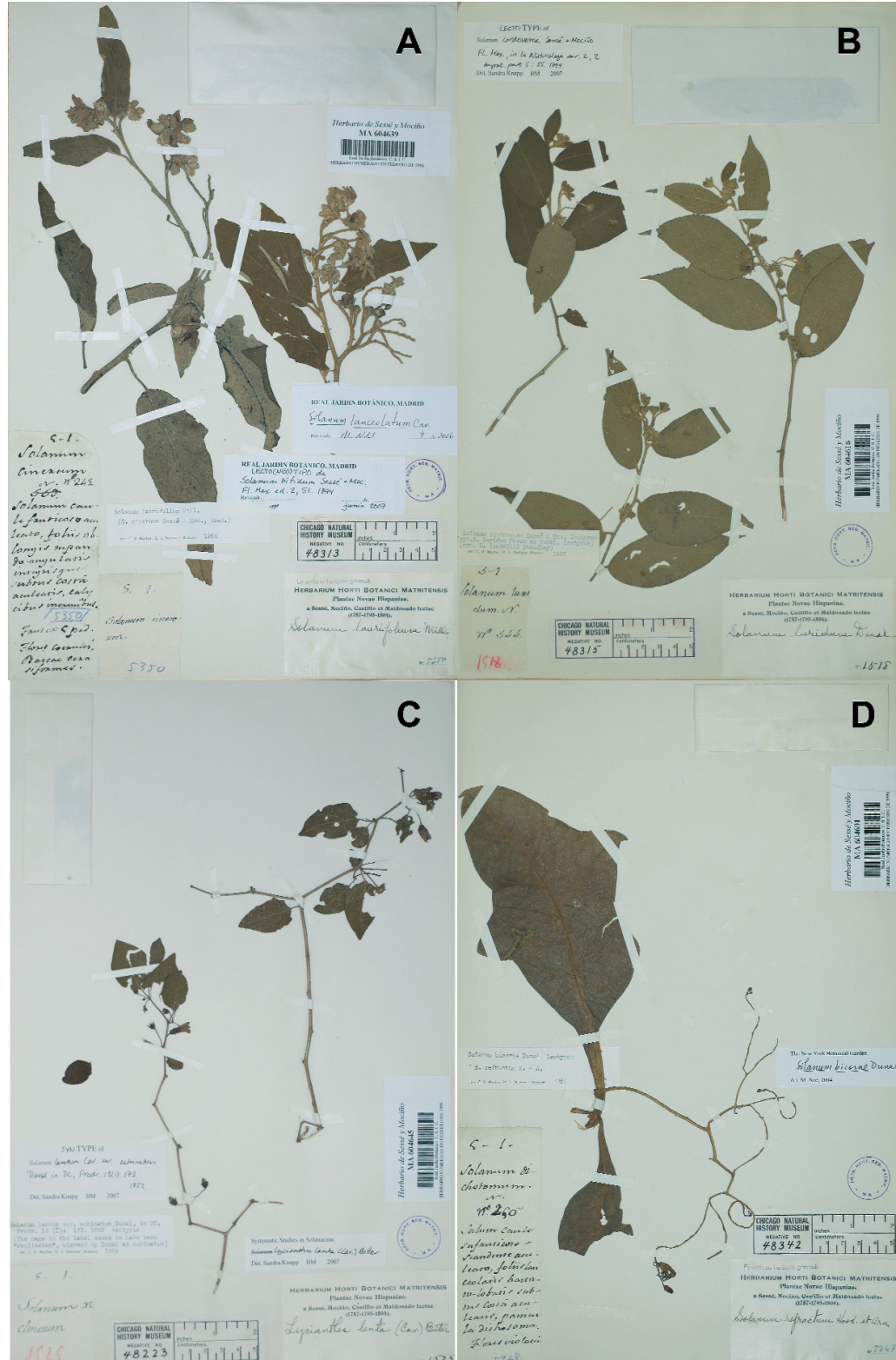
Fig. 1. A , neotype of Solanum bifidum Sessé & Moc. (= Solanum lanceolatum Cav.) (MA 604639); B , neotype of Solanum cordovense Sessé & Moc. (MA 604616); C , neotype of Solanum declinatum Sessé & Moc. (= Lycianthes lenta (Sw.) Bitter) (MA 604645); D , lectotype of Solanum dichotomum Sessé & Moc. (= Solanum refractum Hook. & Arn.) (MA 604601).