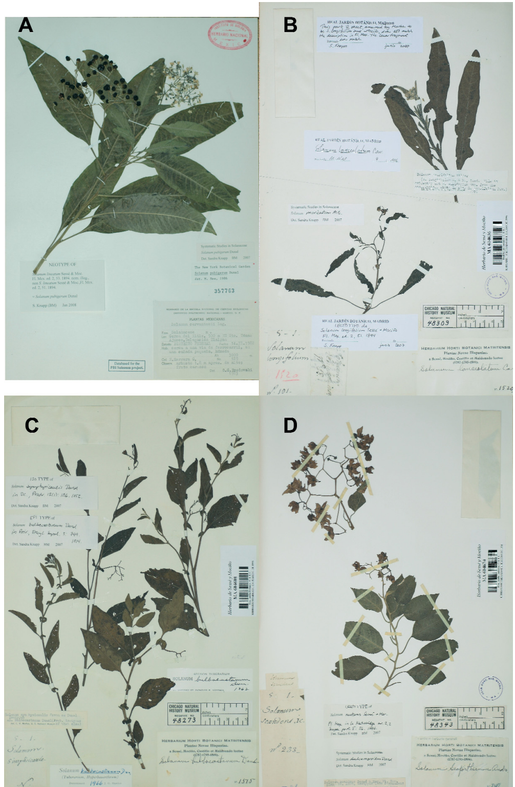
Fig. 3. A , neotype of Solanum lineatum Sessé & Moc. (= Solanum pubigerum Dunal) (Herrera C. 129, MEXU); B , lectotype of Solanum longifolium Sessé & Moc. (= Solanum muricatum Aiton) (MA 206020, lower left hand fragment); C , epitype of Solanum mexicanum Sessé & Moc. (= Solanum bulbocastanum Dunal) (MA 604608); D , neotype of Solanum nutans Sessé & Moc. (= Solanum dulcamaroides Dunal) (MA 604674).