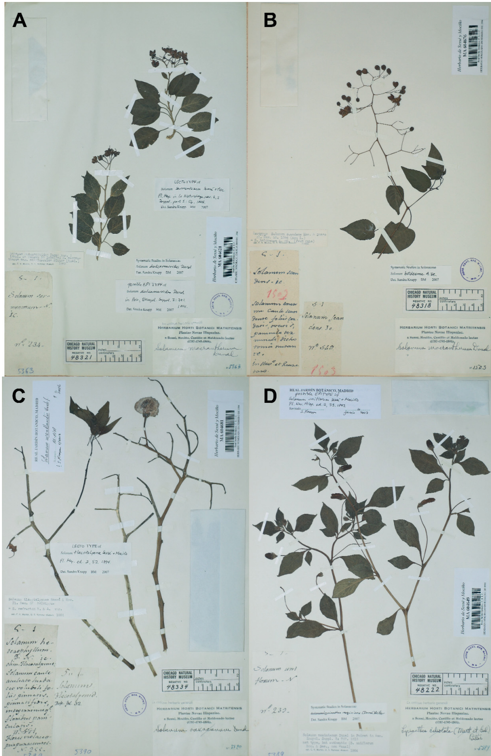
Fig. 4. A, lectotype of Solanum sarmentosum Sessé & Moc. (= Solanum dulcamaroides Dunal) (MA 604621); B, lectotype of Solanum scandens Sessé & Moc. (= Solanum boldoense Dunal & A DC.) (MA 604676); C, lectotype of Solanum tlacopalense Sessé & Moc. (= Solanum wendlandii Hook. f.) (MA 604681); D, epitype of Solanum uniflorum Sessé & Moc. (= Lycianthes mocinianum (Dunal) Bitter) (MA 604649).