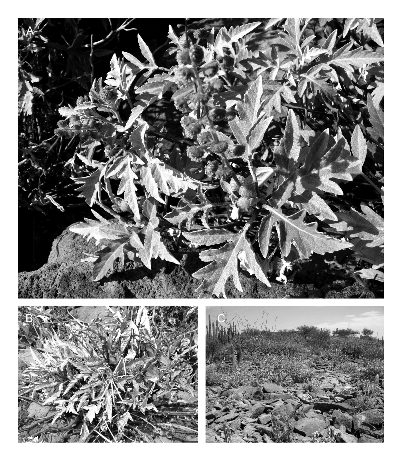
Figure 1. Ambrosia humi León de la Luz et Rebman. A. Plant in bloom (14 Jan 2008). B. Fruiting plant (20 March 2009). C. Habitat in the rocky Mesa de Humí.