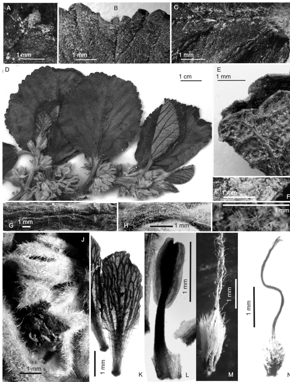
Fig. 3. Waltheria pyrolifolia . A-B, E , leaf apices. A , new, adaxial view; B , young, retuse apex, adaxial view. E , mature (view off-center, adaxial at top; abaxial below). C , young leaf base, adaxial view. D , branch. F, I , new leaf, abaxial view. G , stem. H , stipule. J , floral pair (open bud and flower) from above. K, L, N , permanent slides. K , adaxial petals. L , adaxial stamen. M , lower style and ovary, dry. N , pistil. From GH isotype, with permission from Gray Herbarium.

that used to stretch from Waihee to Waikapu" (about 16 km distance), "that includes the historical locality 'sand hills of Wailuku' is found in