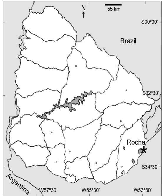
Fig. 2. Distribution map of Pohlia in Uruguay (star).

Webera paucifolia Dusén, is a nomen nudum