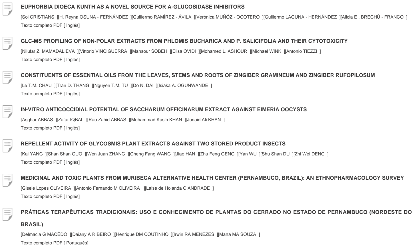
Tabla de Contenido