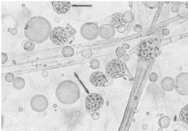
Sporangia with sporangiospores. 40X.

relatively much larger than those of T. lucknowense and T. nigricans so that the glomerulate nature of the sporophore is a much more conspicuous feature of the former species than of the latter when their colonies are viewed with the unaided eye.