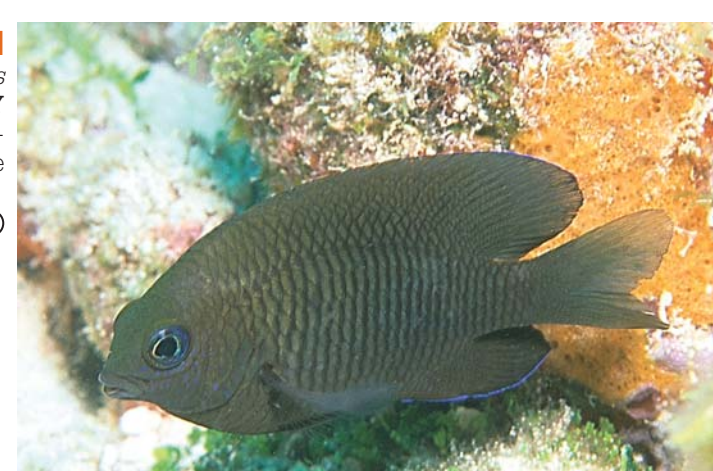
Longfin Damselfish Juvenile

SIZE: 2-4 in., max. 6 in. DEPTH: 2 - 80 ft.