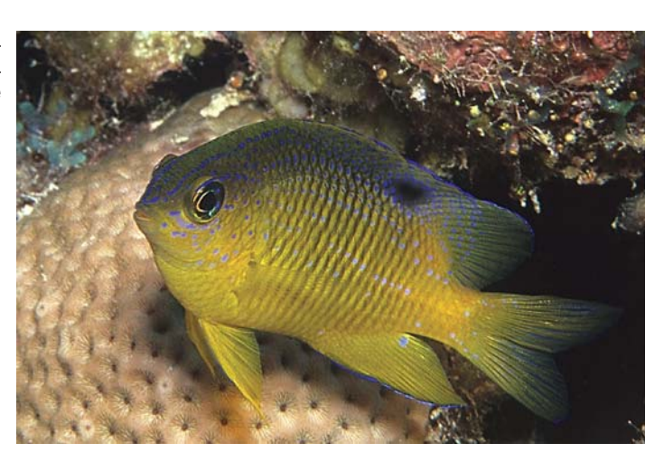
Longfin Damselfish Intermediate

HABITAT & BEHAVIOR: Generally inhabit reefs between 15-80 feet, but frequently on shallower reefs in calm areas. Territorial; pugnaciously chase away intruders. REACTION TO DIVERS: Unafraid; aggressively attempt to chase divers from their territories.