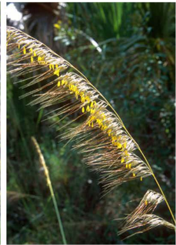
Lopsided Indian grass ( Sorghastrum secundum ) JP