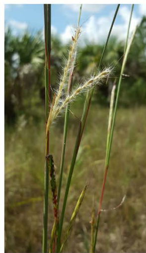
Splitbeard bluestem ( Andropogon ternarius ) JL