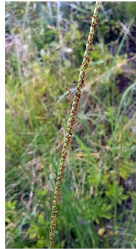
Gulfdune paspalum ( Paspalum monostachyum ) JP