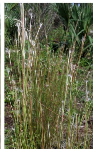
Wire bluestem ( Schizachyrium gracile ) LC