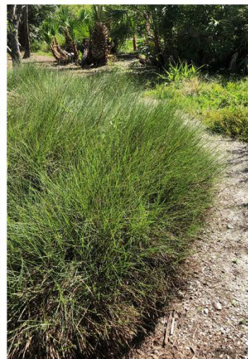
Rhizomatous bluestem ( Schizachyrium rhizomatum ) JP