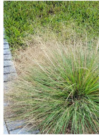
Elliott's lovegrass ( Eragrostis elliottii ) VR