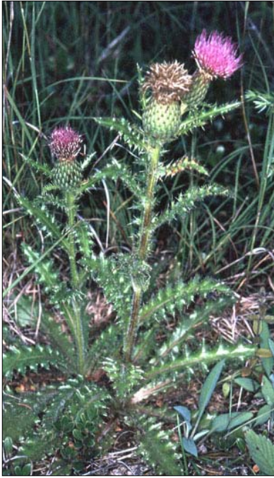
Figure 3. Closeup of Cirsium hillii at Coal Oil Point, Bruce County (8 August 2002).