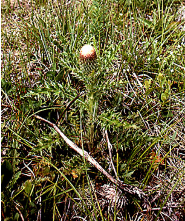
Figure 8. Cirsium hillii going to seed with previous year's seed head in foreground. Wasaga Beach Provincial Park (July 1997).

All of the Ontario populations occur on calcareous sandy soil or on dolostone bedrock.