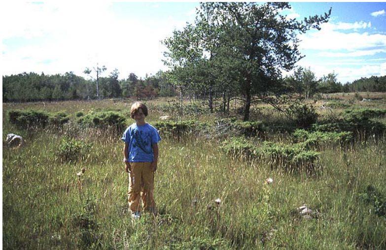
Figure 5. Numerous fruiting Cirsium hillii in open alvar at Fisher Harbour, Little La Cloche Island (6 August 2002).