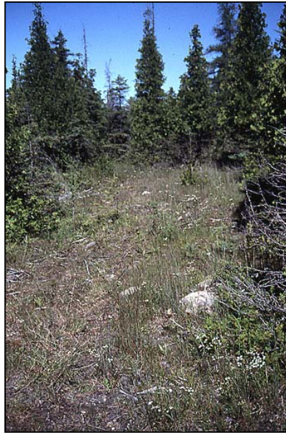
Figure 6. Cirsium hillii in moist, sandy opening within white cedar-tamarack woodland at Pike Bay Alvar, Bruce County (6 August 2002).