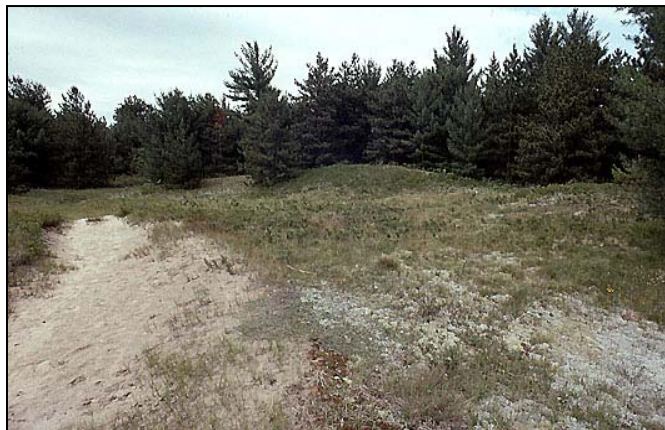
Figure 7. Cirsium hillii habitat in large opening on dunes within red oak-white pine savannah at Wasaga Beach Provincial Park (July 1997).

Moore & Frankton (1966) noted that across its range Cirsium hillii flowers from the second week of June through to the second week of September, with the peak occurring from mid-June to the end of July. In Ontario, flowering occurs from mid-July through August (Moore & Frankton 1974) (see Figure 8). From his work on the species in the Chicago area, Hill considered the season for the species as lasting six weeks, being virtually out of flower by July 25. By this date most plants were noted as already having shed their seed, and by the first of August the stems were generally withered and dry (Hill 1910).