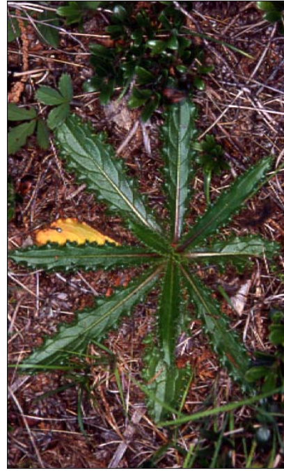
Figure 4. Closeup of basal rosette of Cirsium hillii at Coal Oil Point (8 August 2002).