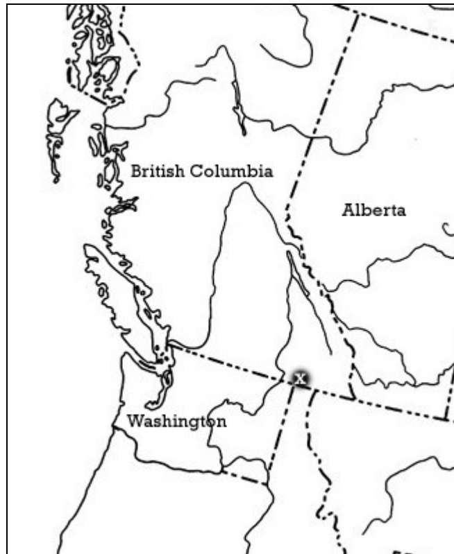
Figure 5. Canadian distribution of the margined streamside moss (X = Boundary Lake area).