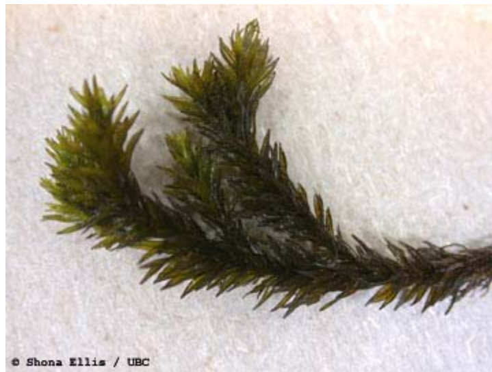
Figure 3. Plant of the margined streamside moss; from SARA website; Environment Canada 2004 (photograph by Shona Ellis).