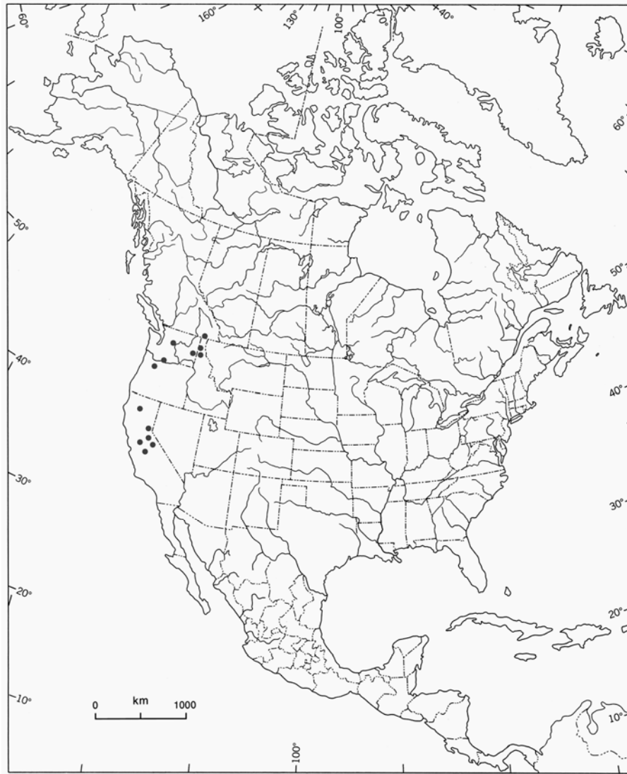
Figure 4. North American distribution of the margined streamside moss; the northernmost dot represents the Canadian population (from Churchill 1985).