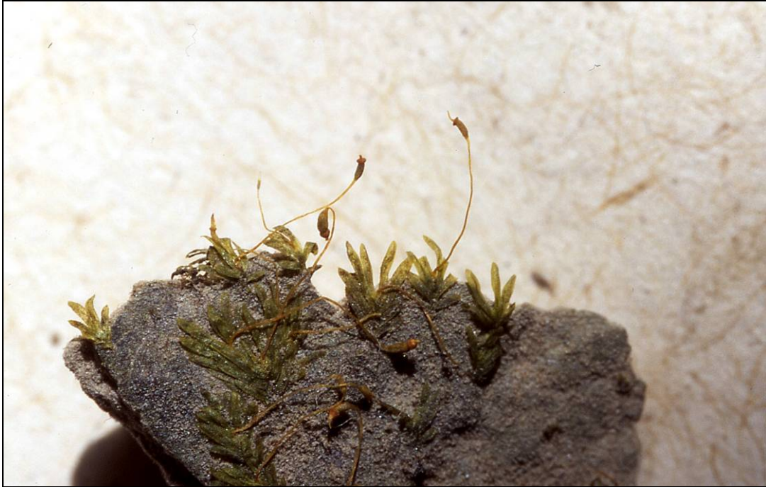
Figure 2. Photograph of the poor pocket moss showing plants and sporophytes with immature capsules.