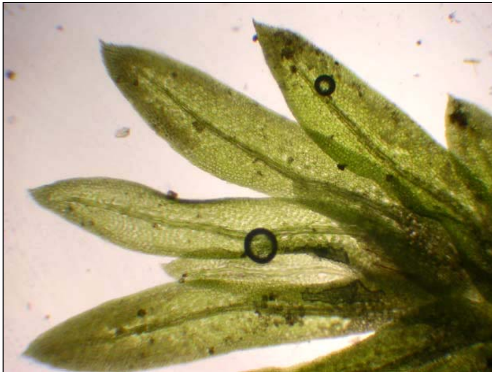
Figure 3. Photograph of leaves of the poor pocket moss.