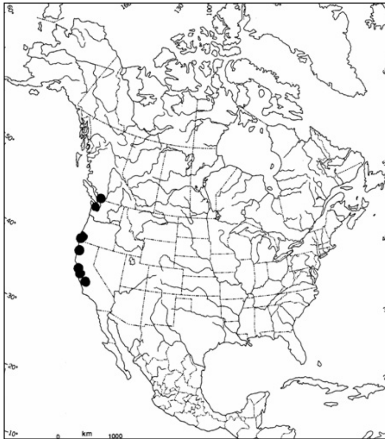
Figure 4. North American and global distribution of the poor pocket moss (from Belland 2001).

In Canada, the six patches of poor pocket moss are restricted to southwestern British Columbia, where it is currently known only from a single location in Lynn Canyon Park in the District of North Vancouver (Figure 5). Lynn Canyon Park is a dedicated urban park owned by the District of North Vancouver. It is zoned “special purpose” for the area around the Ecology Centre and Visitor Centre, and “natural park land” for the remainder. Off-trail hiking and cycling are discouraged by park officials, although off-trail hiking, at least, commonly occurs in many areas, especially where Lynn Creek can be easily accessed, such as about 40 m from the site where this moss is found. The known site for this moss is on the eastern bank of Lynn Creek, downstream of the suspension bridge in a secluded small gully.