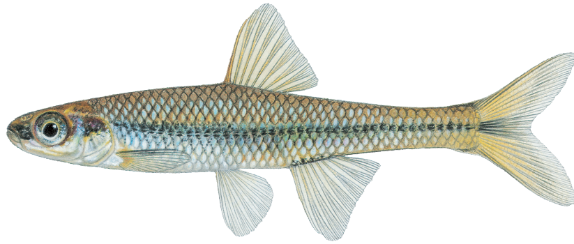
Figure 1. A mature Pugnose Minnow (Illustration © Joseph R. Tomelleri)

This species has recently been re-assessed as Threatened by the Committee on the Status of Endangered Wildlife in Canada (COSEWIC). It was previously listed as Special Concern in 2003 under the federal Species at Risk Act and a management plan was developed in 2009. If the species is listed as threatened under SARA, a recovery strategy will be developed.