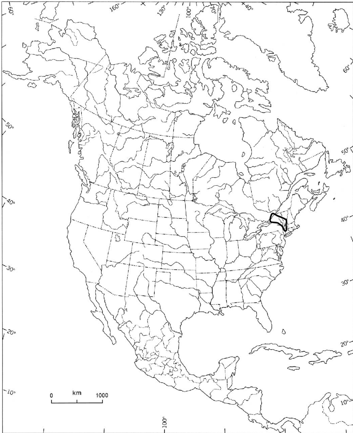
Figure 1. North American distribution of Potamogeton ogedenii (after FNA, 2000).