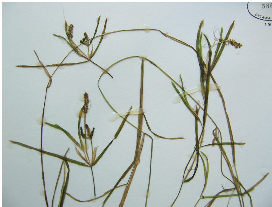
Figure 3. Specimen of Potamogeton ogdenii from Davis Lock (photo of collection at the Department of Agriculture, Ottawa (DAO)).

as C.B. Hellquist or R.R. Haynes. Amongst all these DAO pondweed specimens, only one has been determined to be Potamogeton ogdenii —the 1987 collection from Davis Lock (specimen shown in Figure 3). Since Ogden’s pondweed is probably of hybrid origin between P. hillii and P. zosteriformis , it might be assumed that Ogden’s pondweed would occur where the ranges of the two parents overlapped. Although P. zosteriformis is quite widespread in Ontario, P. hillii is restricted primarily to Manitoulin Island and the Bruce Peninsula—a long distance from the known sites of Ogden’s pondweed. At most locations in the US, however, Ogden’s pondweed is found only with one of the parents, P. zosteriformis (Hellquist & Mertinooke-Jongkind, 2003).