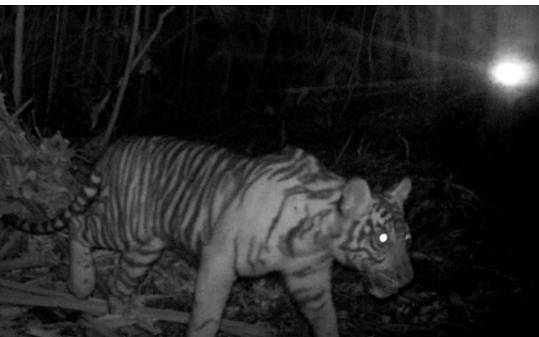
Sumatran Tiger.

The Flat-headed Cat is restricted to peninsular Malaysia, Sumatra and Borneo, and is closely associated with wetlands. It is listed as Endangered by IUCN, due to the widespread loss of wetland habitat throughout the species' range. Five camera trap records from five localities on the Kampar peninsula in the space of a few months is greatly significant, as this elusive species is rarely detected.