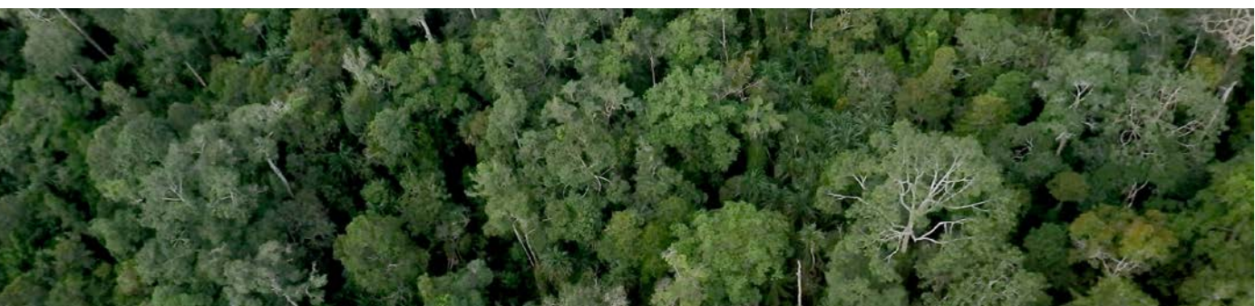
Kampar Peninsula peat swamp forest.

There are four protected areas within the peninsula: three Game Reserves (Tasik Belat, Tasik Metas, Tasik Serkap) and Zamrud National Park, which together total 45,000 ha. The remaining peat swamp forests on the Kampar peninsula are virtually enclosed by a ring of fibre plantations (primarily Acacia crassicarpa ). The three ERCs licensed to APRIL that are described in this Report constitute 92,507 ha within this peninsula.