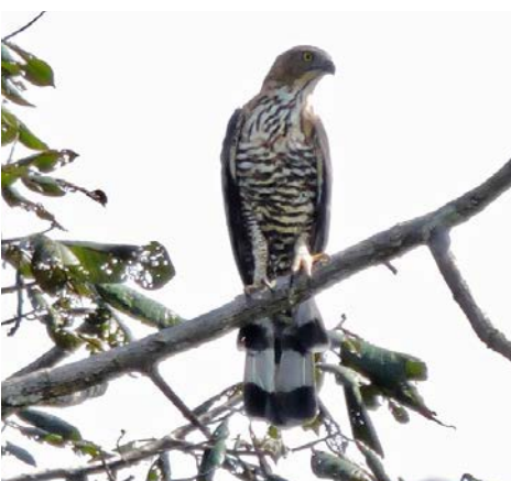
Wallace's Hawk-eagle, Vulnerable.

CR: Critically Endangered, EN: Endangered, VU: Vulnerable