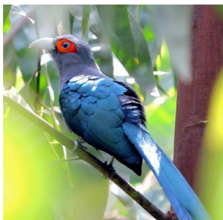
Chestnut-bellied Malkoha.