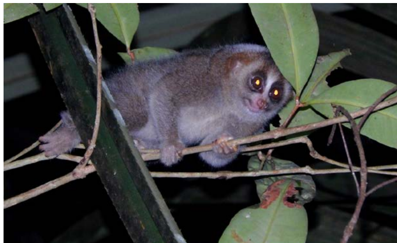
Sunda Slow Loris.