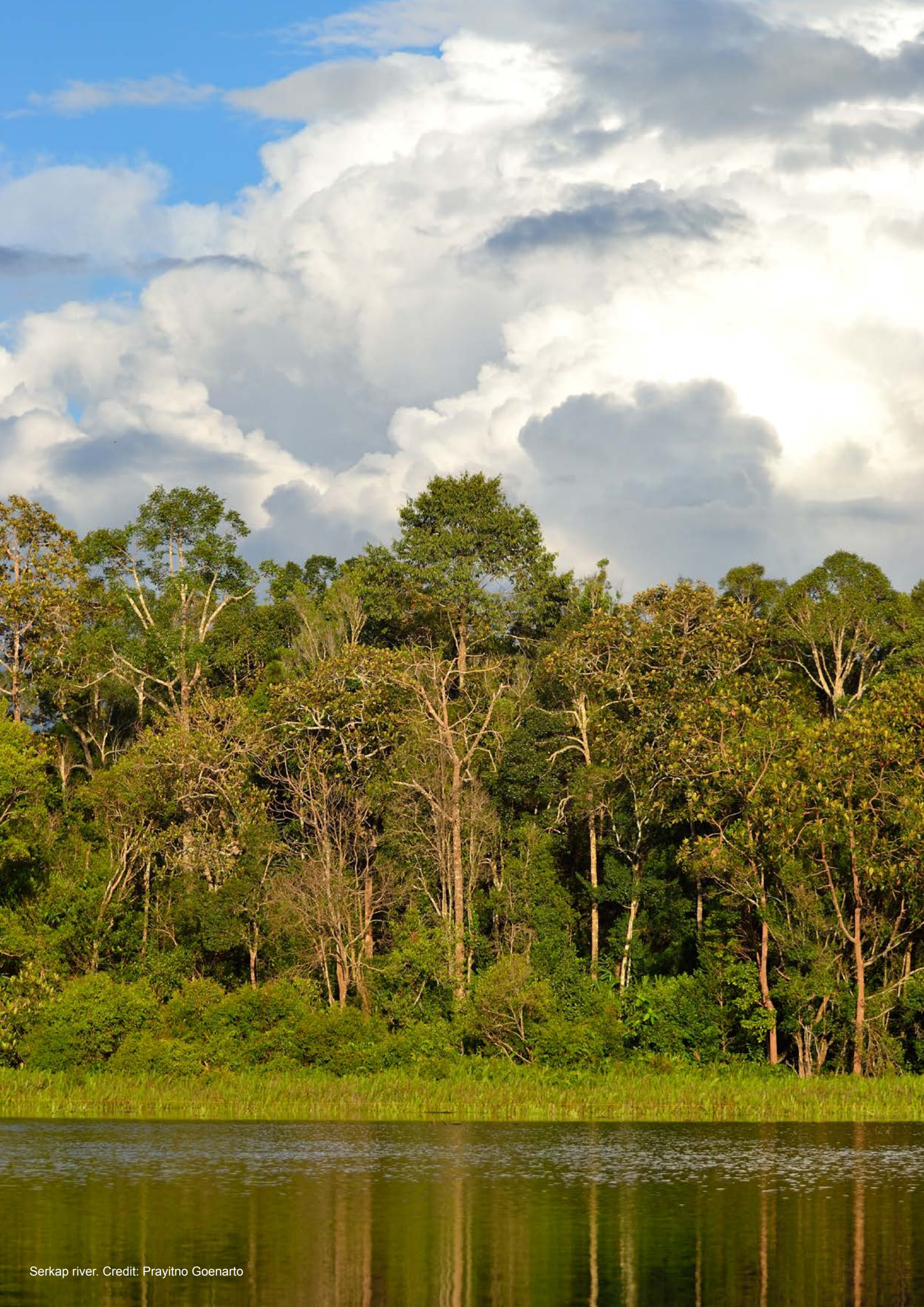
Serkap river.