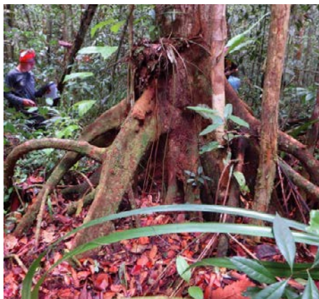
Stilt-root of Suntai, Palaquium sumatranum