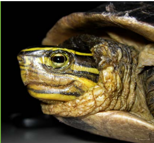
Amboina Box Turtle.

The presence of a number of globally threatened reptile species in the Kampar peninsula highlights the importance of this region for reptile conservation.