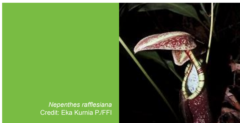
Nepenthes rafflesiana