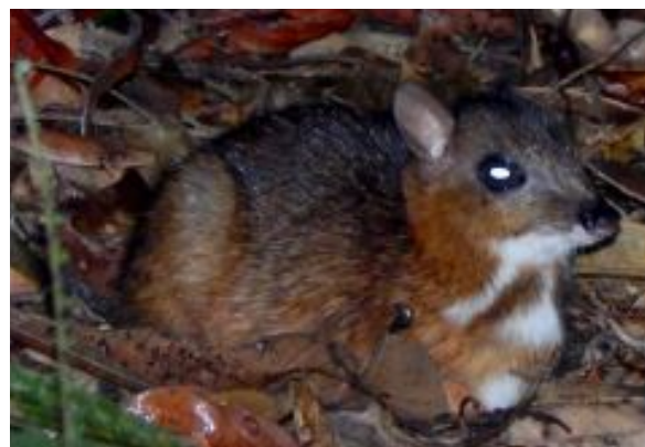
Chevrotain spp.

The three large mammals of Sumatra, Sumatran Elephant Elephas maximus sumatranus , Sumatran Rhinoceros Dicerorhinus sumatrensis and Malayan Tapir Tapirus indicus were not recorded. There is no historical record of elephant occurrence in the peat swamp forests of the Kampar peninsula. The remaining populations of Rhinoceros on Sumatra are confined to dryland and upland forests, and probably have not extended into peat swamp forests. No data exists for the occurrence of Tapir. Future surveys may reveal presence, as this region lies within the tapir's known range on Sumatra, and it is found in peat swamp forests elsewhere. The Malayan Sunbear Helarctos malayanus was recorded.