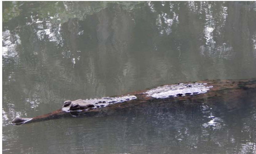
False Gharial, Vulnerable.