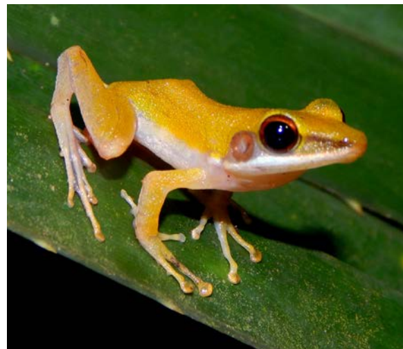
Hylarana parvaccola , endemic to Sumatra.

The presence of four species from Varanidae was confirmed, three recorded by FFI and one by LPPM IPB HCV Report in 2015. The monitor lizards are a species complex yet to be worked on by taxonomists, and will undoubtedly reveal many species in years to come.