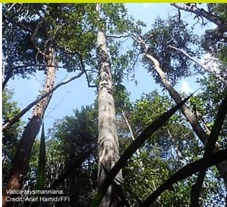
Vatica teysmanniana .

In addition to trees, 4 species of orchid were identified: Bulbophyllum vaginatum , Dendrobium sp. and Phaius sp. Pitcher plants were present, including the two most common peat swamp forest species: Nepenthes ampullaria and N. rafflesiana . Three species of palm were recorded: the sealing wax palm Cyrtostachys renda , which is common in cultivation, Palas Licuala spinosa and Asam Paya/Kelubi Eleiodoxa conferta . These palms are often found growing in the understory, mainly in areas close to streams.