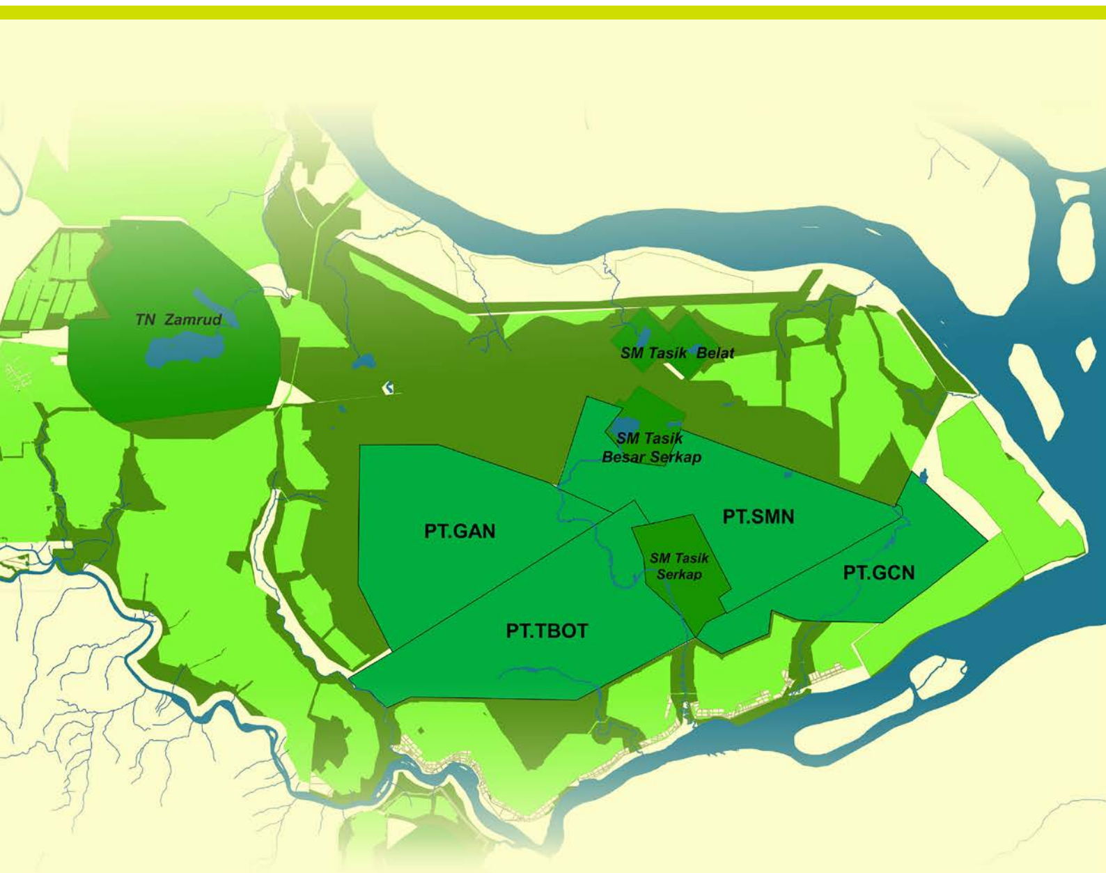
Location of four RER concessions on Kampar Peninsula, Riau