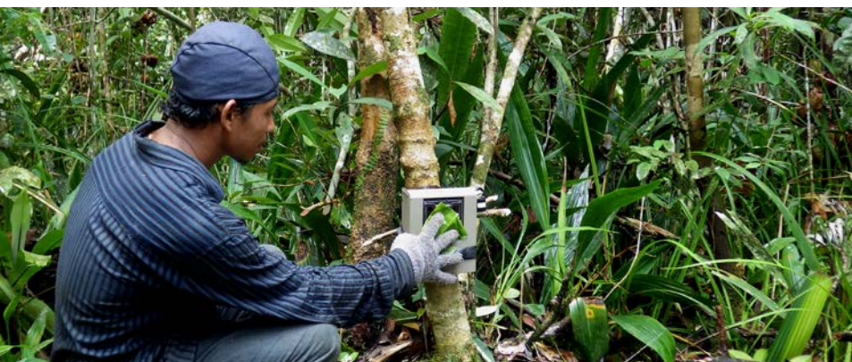
Setting a camera trap to record the more elusive wildlife of the Kampar peat swamp forest.

Amphibians and reptiles were recorded from visual sightings made along the set transects. Surveys were conducted in the morning and evening for 18-30 days in each concession.