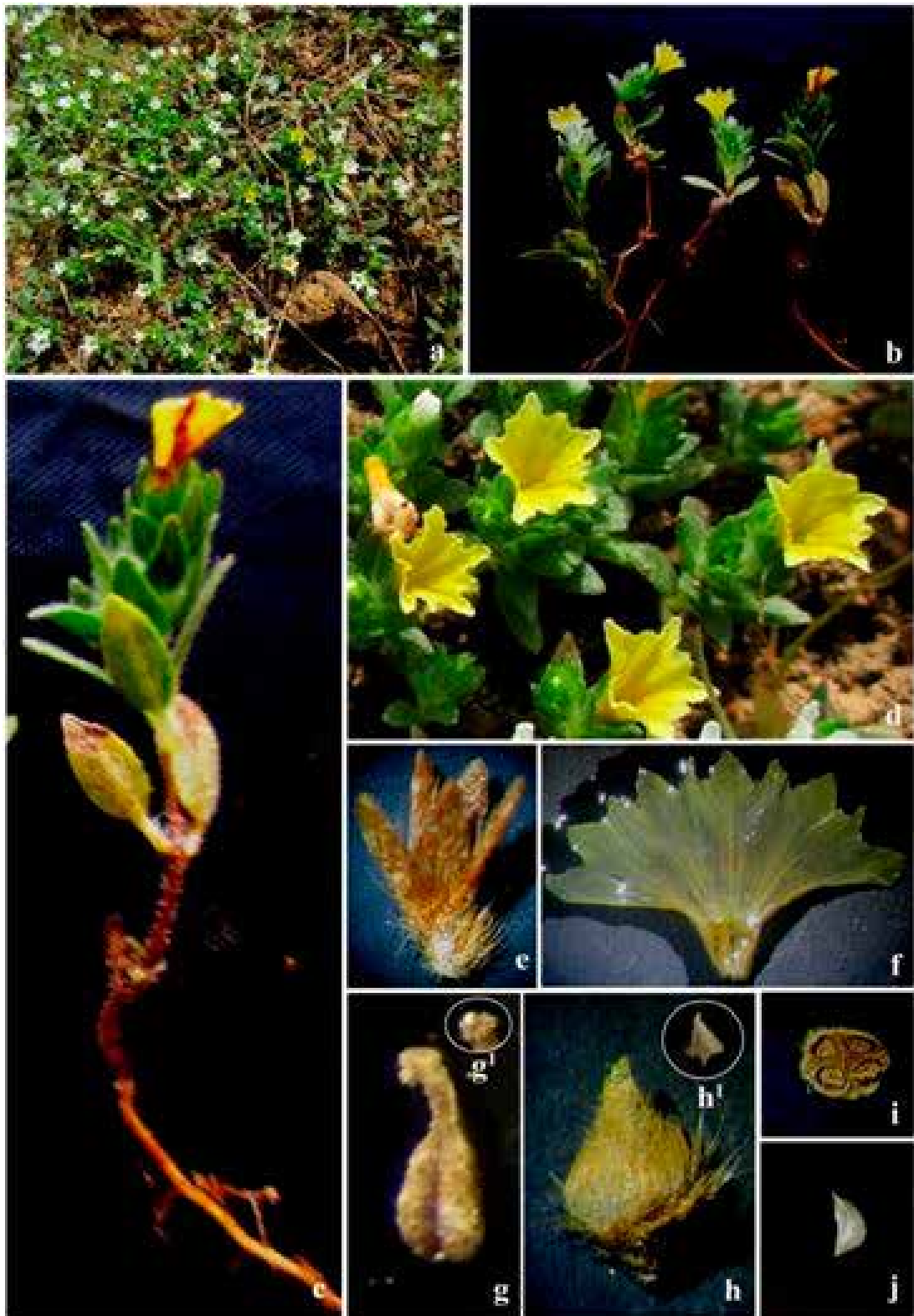
Fig 2. Euploca baclei (DC.) Diane & Hilger: a. Habitat; b. Habit; c. Single plant; d. Flowers; e. Calyx; f. Corolla split open; g. Anther; g 1 . Protracted connective with pubescent (inset); h. Beaked fruit; h 1 . Mericarp (inset); i. C.S. of fruit with four nutlets; j. Curved embryo.