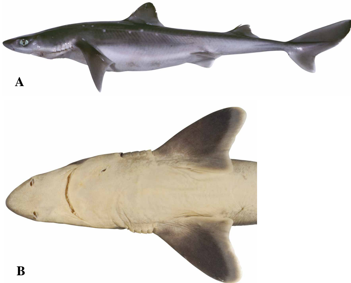
FIGURE 3. Squalus acanthias : A, Lateral view of CSIRO H 1214 (female 678 mm TL); B, Ventral view of head of CSIRO H 4876-01 (adult male 616 mm TL).

the pectoral-fin insertion and pelvic fin origin. This finding is somewhat consistent with that of Jordan & Evermann (1896), although these authors observed that the position of the first dorsal-fin spine was more posterior to the pectoral-fin. Our findings also indicate that the pelvic-fin is proportionally closer to the second dorsal-fin in S. suckleyi while in S. acanthias it is closer to the first dorsal fin. This finding is consistent with those of Bigelow & Schroeder (1957) and Garrick (1960). Jones & Geen (1976) found similar results, but concluded that these differences were due to the effects of length and sex for individual specimens.