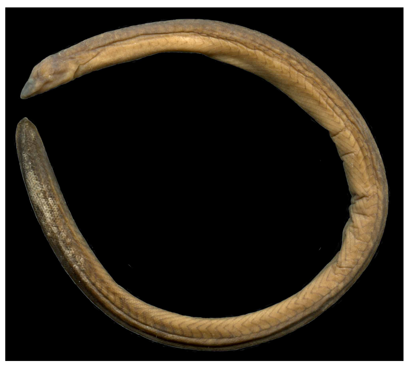
FIGURE 1. Holotype of Monopterus ichthyophoides , PUCMF 3005, 186.6 mm TL, Sawleng River, Mizoram, India, in lateral view.