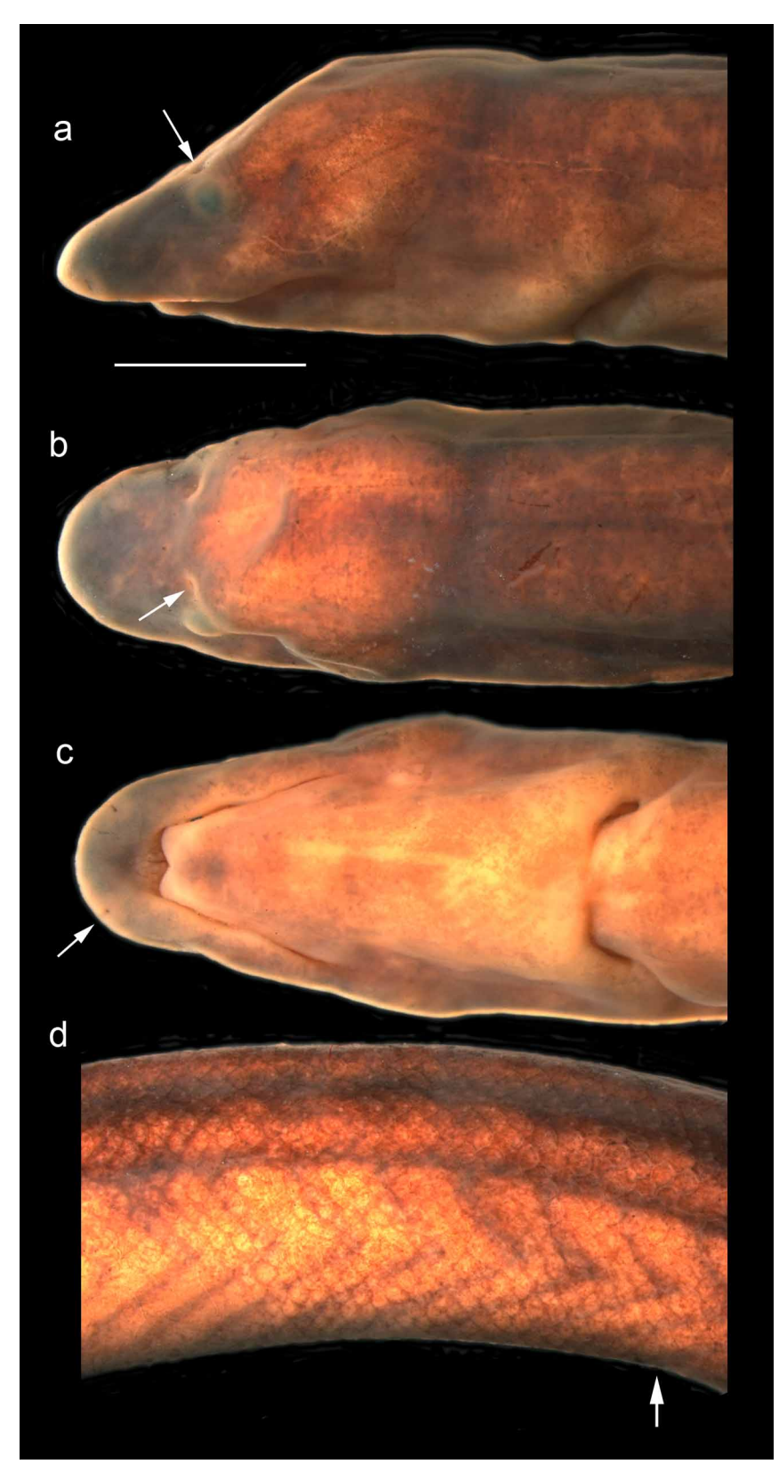
FIGURE 2. Holotype of Monopterus ichthyophoides , PUCMF 3005, 186.6 mm TL. Head in lateral (a), dorsal (b) and ventral (c) view (arrows mark position of posterior naris in a and b and anterior naris in c) and preanal area of body in lateral view (d) to show scales (arrow marks position of vent).