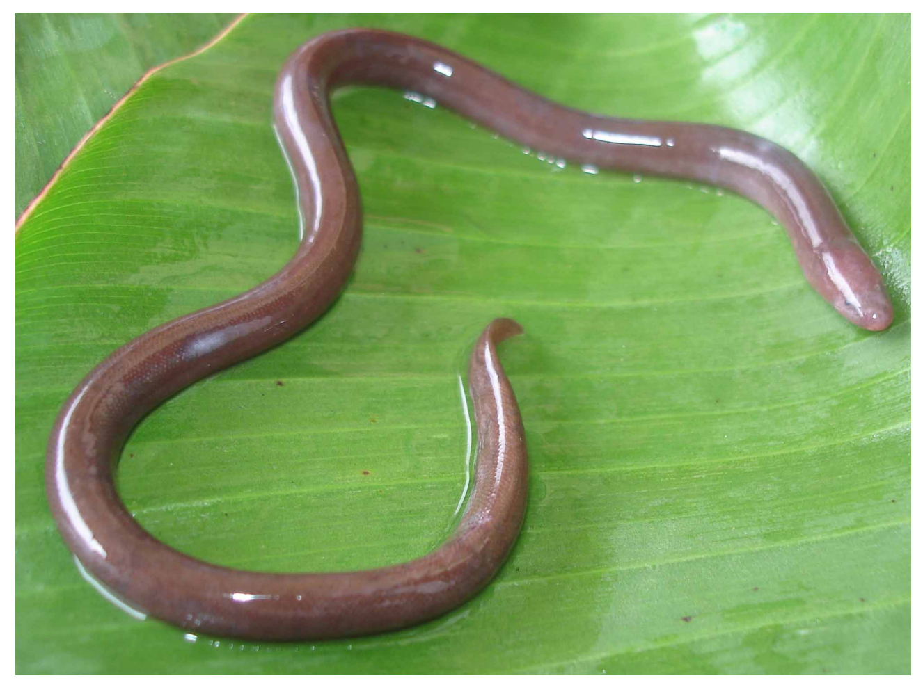
FIGURE 4. Live specimen of Monopterus ichthyophoides , PUCMF 3006, one of the paratypes, 30 July 2008, public well at Luangmual, Aizawl, Mizoram, India.

FIGURE 3. Cleared and stained gill arches of Monopterus ichthyophoides , PUCMF 3006, 180.8 mm, paratype, dorsal view. aCH, anterior ceratohyal; BB, basibranchial; BH, basihyal; BR, branchiostegal rays; CB, ceratobranchial; dHH, dorsal hypohyal; EB, epibranchial; PB, pharyngobranchial; pCH, posterior ceratohyal; UP4, upper pharyngeal toothplate 4.